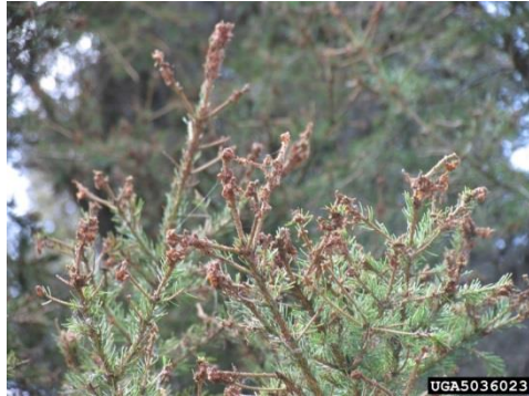
Figure 7. Spruce budworm feeding damage.

Based on predictions that budworm will become a problem in the next few years the Maine Forest Service is coordinating a statewide spruce budworm monitoring program. For the second year, large landowners and managers are helping by deploying pheromone traps in almost every township across the northern half of the state. There will be over 1200 traps monitoring more than 400 sites. The wide coverage will give us an idea of where and when the budworm populations are increasing in Maine. The monitoring program will continue each year to aid in making management decisions for protecting the spruce/fir resource.