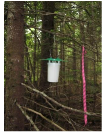
Figure 6. Pheromone trap deployed for spruce budworm monitoring.

In northern Maine keep an eye out for defoliation on fir (the favored host of spruce budworm) and spruce. They are messy feeders that web old needles together. Emerging second instar spruce budworm larvae start feeding as needle miners primarily on last year's needles before moving to the buds on fir. Then larvae feed on the buds, then on new foliage and finally go back to feeding on older foliage. If you notice this damage on fir and spruce, take photos and/or send a sample to the Lab. In July, report any flights of small brown moths. If possible catch some and send them to the Lab.