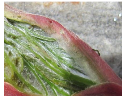
Figure 9. Winter moth larvae on maple bud.

Winter Moth ( Operophtera brumata ) – Winter moth larvae started emerging the first week of May – a week later than in 2014 - and are feeding on oak, apple, maple, birch, blueberry and other deciduous trees and shrubs. As of this week larval counts in Harpswell, Cape Elizabeth, Kittery and South Portland indicate that the early November snow and cold reduced the populations significantly compared to last year and populations are especially down from 2013. We hope defoliation will be lighter in most locations.