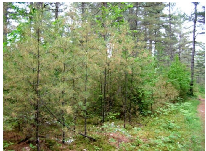
Figure 12. Young white pine regeneration heavily infected with brown spot needle disease, Bethel, Maine on June 14, 2011.

White Pine Needle Diseases – One-year-old needles of white pines infected with any one of the several needle diseases prevalent during the past several years will begin to appear yellowish-brown to tan and start to be shed from affected trees within the next two weeks or so. The great majority of infections are caused by the brown spot fungus, Lecanosticta acicola (= Mycosphaerella dearnessii ), but several other fungal pathogens may also be present. Heavy needle shedding is expected to last throughout the month of June, and should be largely completed by the first week in July. Affected trees will appear thin in the crowns, as the current-season needles emerging from the buds will not yet be fully expanded.