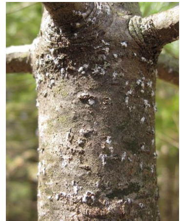
Figure 3. Pine bark adelgid flocculence on an eastern white pine stem (April 2014).