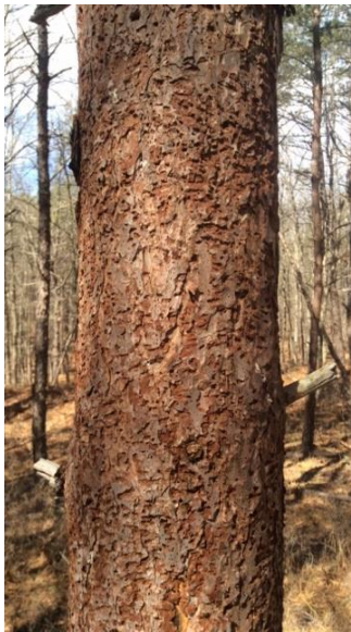
Figure 5. Southern pine beetle galleries.

Southern Pine Beetle ( Dendroctonus frontalis ) – In April, crews from the Forest Inventory & Analysis unit travelled to Long Island, New York as part of the Northeast Forest Fire Compact, to assist the New York State Department of Environmental Conservation (DEC) with efforts to control a recently detected outbreak of southern pine beetle. They surveyed and delimited infestations on DEC properties in Suffolk County. Crews worked directly with DEC staff, learning how to identify southern pine beetle damage as opposed to damage caused by other beetles, and becoming acquainted with the data collection protocols and technology.