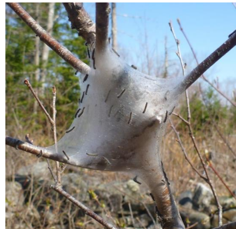
Figure 2. Eastern tent caterpillar web and caterpillars in pin cherry.

Eastern Tent Caterpillar ( Malacosoma americanum ) – Populations of eastern tent caterpillar seem to be slightly higher than normal. In the Capitol Region, it is not uncommon to see roadside cherry or crab apple trees festooned with several webs. Most trees defoliated by this pest will refoliate later in the season with little notable impact. If webs are considered unsightly in ornamental trees, they can be removed in the evenings by winding them around a forked stick and soaking the resulting mess in a bucket of soapy water. Similar tactics or registered insecticides can be used on fruit-bearing trees. Early intervention will reduce the amount of defoliation. Seabrooke Leckie has an informative blog-post on the natural history of this insect.