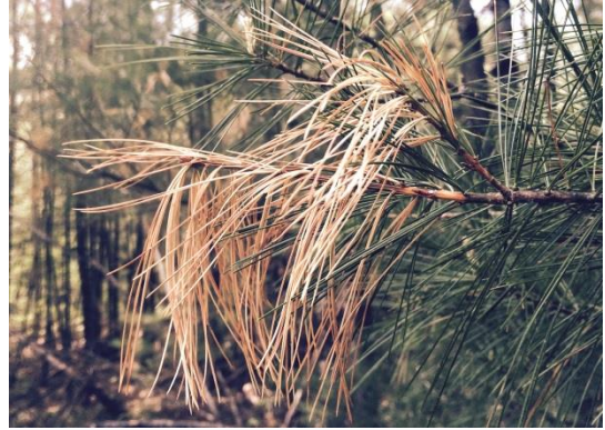
Figure 4. Branch flagging suspected to be caused by previous-year feeding by pine spittlebug.

Pine Spittlebug ( Aphrophora cribrata ) – Flagging of eastern white pine branch tips assumed to be associated with previous-year feeding damage by pine spittlebug was noted in Augusta (Kennebec County). The needles of affected shoots have a wilted, bleached-orange appearance. Upon dissection, a necrotic spot consistent with spittlebug feeding injury can be found inside the twig at the junction of live and dead tissue.