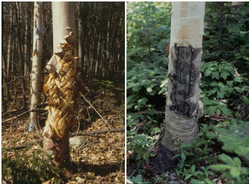
Figure 10. Logging injuries to paper birch during mid-summer (left) and an older injury (right), five years after the harvesting damage was inflicted. MFS Photo.

Damage to Residual Trees during Spring Harvesting Operations: A Caution - Harvesting is a fundamental activity of forestry which provides a wide variety of wood products and economic value to