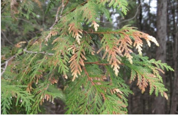
Figure 11. Winter injury to Northern white-cedar, Newport Maine.

Needle Diseases of Arborvitae (Northern White-Cedar) – Observations and reports of foliage and branch tip death in northern white-cedar in natural stands and in ornamental settings have been received this spring. The most obvious symptom seen includes a “bleaching” of the tip-most foliage, which