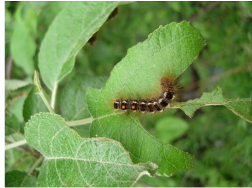
Figure 1. Browntail moth caterpillar.

Browntail Moth ( Euproctis chrysorrhoea ) – The caterpillars of the browntail moth are actively feeding now. If your oaks, apple, cherry, birch and other hardwoods are being defoliated check and see what kind of caterpillar is feeding. It could be browntail, winter moth, eastern tent caterpillar, fall cankerworm, Bruce spanworm or maybe something else! Browntail is the only one of these that will cause a rash. They are hairy, dark brown with two white stripes and two orange dots.