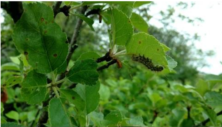
Infected browntail moth caterpillar in Turner.