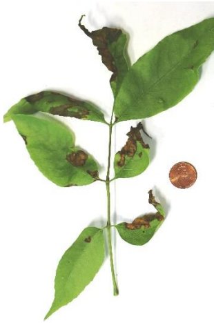
Ash anthracnose on white ash

Anthracnose Diseases of Hardwoods – Anthracnose diseases have been frequently reported and encountered this spring. The higher level of anthracnose prevalence is due to 2019’s spring weather. The long periods of high moisture and cool weather have created perfect conditions for the increased prevalence of Anthracnose diseases. Separate Anthracnose species occur that are mostly specific to a certain host species. An exception was oak anthracnose observed on the leaves of planted chestnut trees in two separate locations in southern Maine. In these locations, nearby oaks were impacted similarly. Additionally, significant leaf deformation from oak anthracnose has been observed throughout Central and Southern Maine. Heavy defoliation from ash anthracnose has been reported Camden and Bath, while severe damage from sycamore anthracnose has been reported in Hallowell and Portland. Maple anthracnose and birch anthracnose prevalence is also expected to be higher this year, although few observations of these fungal leaf pathogens have been reported thus far. Trees heavily impacted by