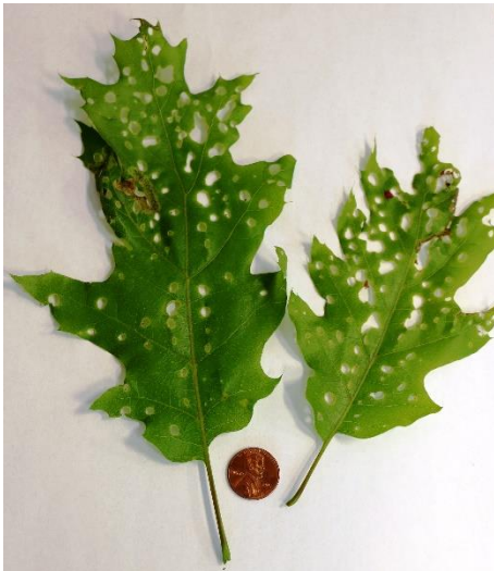
Typical damage caused by oak leaf shothole leafminer on red oak.

Mines Rd. In fact, Google Maps satellite imagery shows the extent of the damaged area quite well where the Mines Rd passes between Second and Third Ponds. Here and elsewhere, areas near lakeshores like this tend to be disproportionately affected by defoliators, likely owing to a favorable microclimate capable of supporting large caterpillar populations. Additionally, the north side of the Mines Rd, with its southern exposure, was also clearly much more severely affected than the south side of the road in this stretch. Although oaks are generally very resilient and able to withstand several years of defoliation or drought alone, the combined stress of both has proven too much in this case.