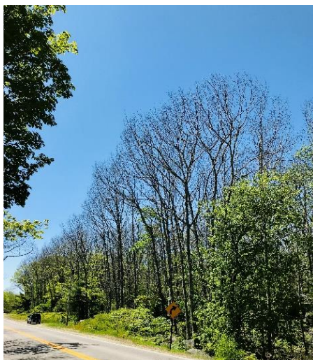
Oak mortality along the Mines Road, Blue Hill.

Forest Tent Caterpillar ( Malacosoma disstria ) – For the third year in a row, the entomology lab has received reports of extensive forest tent caterpillar defoliation along the Mines Rd in the town of Blue Hill. Once again, we expected quite a bit of current-year caterpillar activity from the sound of these reports, but all was surprisingly quiet when the site was checked in early June. After locating the core damage area, this site visit began just like any other by looking and listening for the sights and sounds of an active forest tent caterpillar infestation. A close look at the forest floor however showed no evidence of damaged leaves dropped prematurely or leaf trimmings with tell-tale signs of caterpillar feeding. Although most trees were totally bare, some were still managing to push out small leaves, stunted and late but clearly not fed upon. The distinct sound of frass rain falling on the dry leaves on the forest floor was also missing. Finally, there were no signs of caterpillars or their lingering cocoons, sure to have been left behind and visible if the population had been large enough to cause this much damage in a single season.