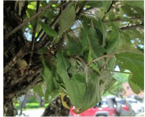
Browntail pupal cocoon on Malus .

Browntail Moth ( Euproctis chrysorrhoea ) – The caterpillars have begun spinning cocoons to pupate in. We remind you that the cocoons, which can be found in sheltered areas such as on cars, boat trailers campers and eaves of houses as well as on the host tree leaves, are loaded with toxic hairs. The cocoons may contain multiple caterpillars/pupae and the toxic hairs that come along with them. It is also important to remember to check vehicles, camper, trailers, etc., for cocoons before you travel so you aren't bringing them along for the ride. When possible, don't park near infested trees, learn to recognize the cocoons and remove them if you find them. If you frequently travel between infested and uninfested areas, be on the lookout for signs you've taken this hitchhiker for a ride.