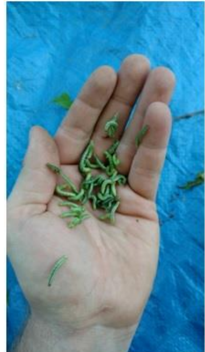
Winter moth caterpillars in Kittery.

Winter Moth ( Operophtera brumata ) – This spring, MFS staff collected winter moth caterpillars from various sites along the southern coast of Maine to determine if prior releases of Cyzenis albicans , a parasitoid fly of winter moth, have led to their establishment. In June we collected caterpillars from Kittery, Cape Elizabeth, South Portland, Harpswell and Tenant’s harbor (with the help of Amy Palmer). These collections allow us to determine the rate of parasitism present in each population and to collect C. albicans for use in future biocontrol releases. C. albicans is very host specific and only parasitizes winter moth, leaving our native species alone. The collected winter moth pupae will be delivered to the Elkinton lab at University of Massachusetts to determine the rate of parasitism and will be returned to Maine in order to release them at a new site. We have received reports of severe winter moth defoliation in a few locations, mostly in the Midcoast region, with Boothbay Harbor being especially hard hit. At one of our previous release sites in South Portland, the homeowners have described a remarkable reduction in defoliation going from “strips of leaves” to the normal shot hole damage typical of lighter infestations. We are looking forward to carrying this biocontrol program into the future and the day that C. albicans is established throughout coastal Maine.