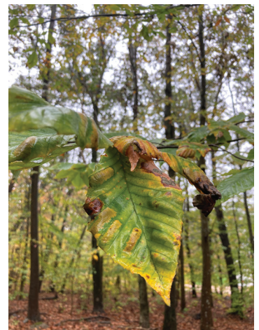
Figure 3.—Advanced symptoms of BLD with chlorotic striping.