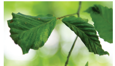
Figure 2.—Banding appearance and shrunken leaves associated with BLD.