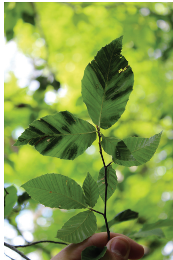
Figure 1.—Banding appearance associated with BLD.

BLD appears to be spreading, particularly from west to east based on the number of new county detections in recent years. Insect or avian vectors as well as human-mediated movement of the nematode are possible modes of its dispersal that are currently being studied. There is likely a delay between initial nematode infestation and BLD detection as L. crenatae has occasionally been confirmed in asymptomatic tissue at the molecular level.