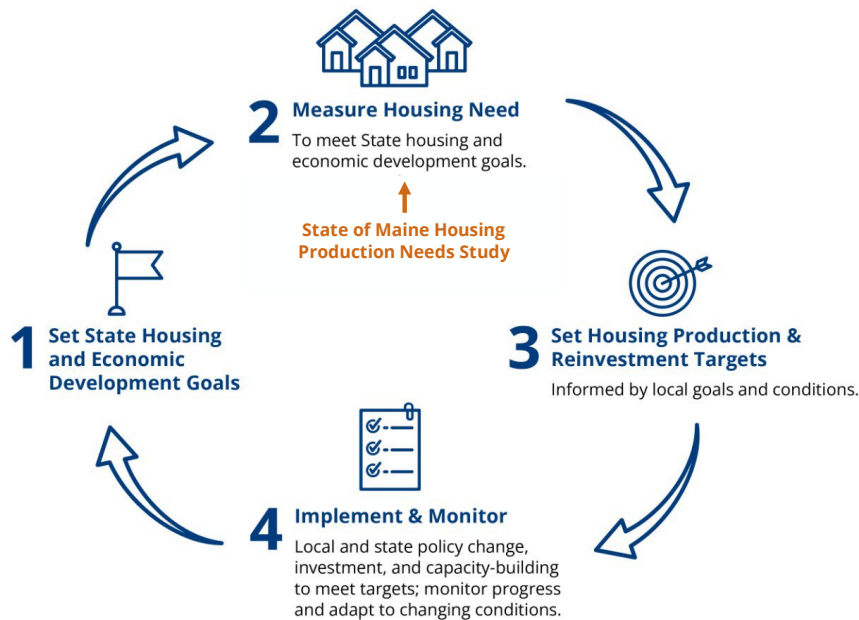
Figure 2: Setting Housing Production & Reinvestment Targets

This Study provides analysis to help guide that process (Figure 2). As local planning follows, local adjustments to these targets should be balanced with the likely impact on the availability and affordability of homes for existing Mainers and the economic health of the state. These production targets will also need to be monitored over time as economic and demographic conditions change and as municipalities take steps to meet these targets. For more information about the Study approach, see report page 12.