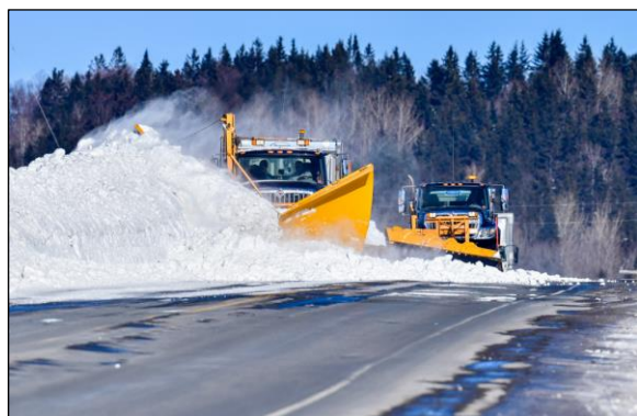
Figure 8 The amount of snowfall in northern Maine requires frequent use of snowplows and road salt.

When planning infrastructure improvements in a state that sees between 50 and 90 inches or more of average annual snowfall between the southern parts of the state and the northern parts of the state, respectively, MaineDOT has always thoroughly considered the impact a changing climate has on mobility. MaineDOT's Climate Initiative is laid out on their website at https://www.maine.gov/mdot/climate/ . MaineDOT is a key partner in the Maine Climate Council . MaineDOT also realizes