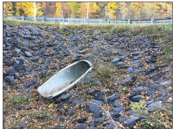
Figure 11 A drainage pipe under US 1.

The Reason Foundation, a nonpartisan public policy research group, found in 2018 that "Maine declined 21 positions from 4th to 25th in the overall [highway performance] rankings, as the state saw dramatic drops of 26, 40, and 26 positions for rural Interstate pavement, rural arterial pavement, and urbanized area congestion rankings, respectively. Maine's ranking last year may have been an aberration, as the year prior