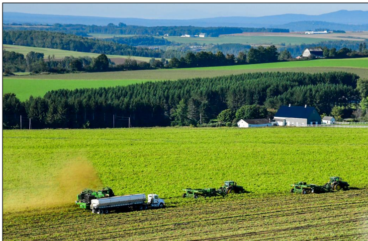
Figure 10 Potato farming in the region.

Highways are the nation’s primary means of rapidly moving goods and people far distances in a cost-effective manner. Highways help connect families and communities, deliver medical supplies, and keep store shelves stocked. An efficient transportation network helps keep prices low and product availability high. Long periods of challenging weather make roads even more crucial to connecting goods and services and the people who need them. In northern Maine, there is but one primary highway—US 1—and