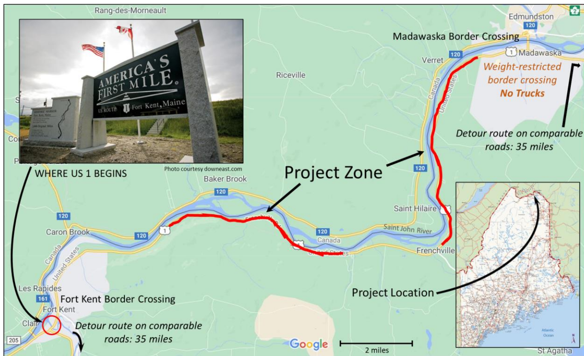
Figure 3 Map of Project area.

It can be challenging to connect with family via poor roads. For generations, Acadians (descendants of the French who settled in what is today Eastern Canada's Maritime provinces and northern Maine) and Mainers have viewed the Saint John Valley not as part U.S. and part