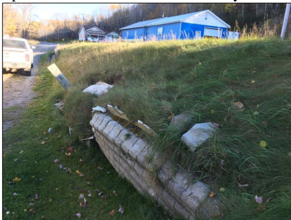
Figure 7 A section of retaining wall holding up an embankment below the road surface is compromised and threatening a private driveway below.

If a RAISE grant is not awarded and the Project is not completed as described, this portion of US 1 will continue to exist as the weak link in the chain that is northern Maine's primary road. While repairs will be made from time-to-time, important components of the road such as the culverts that allow for fish passage will not be as effective as they could be today and may be threatened with collapse in the future. As pipes and culverts eventually fail, they will be replaced. That failure will most likely occur sporadically, meaning exhaustive repairs would be