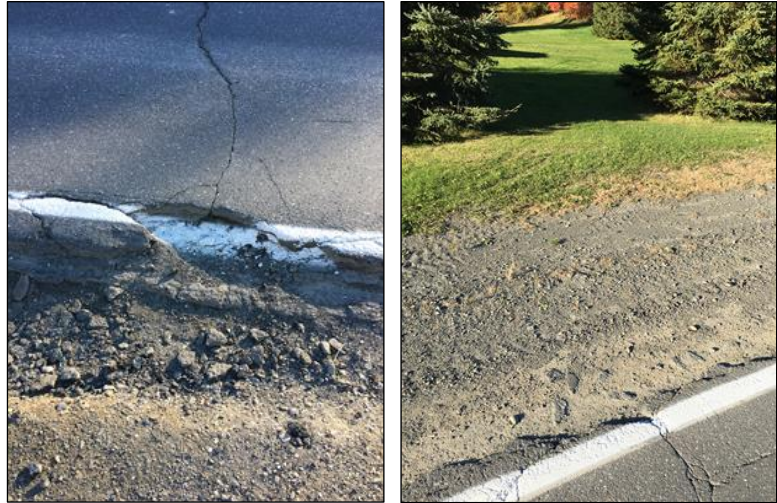
Figure 4 (left) Road surface cracking and breaking apart near edge, creating instability for vehicles, bicycles, and pedestrians using shoulder. (Right) Gravel shoulder compromised by erosion, wash boarding, and pavement cracking.

US 1 is a Minor Arterial Highway, non-NHS, and classified by MaineDOT as Highway Corridor Priority 2. Volume projections of current and future traffic are noted in the accompanying chart. For the past 25 years, MaineDOT has been reconstructing and modernizing US 1 piece by piece, applying funding to the road in sections, recognizing how critical the route is while also meeting the infrastructure needs of the much higher populated southern Maine.