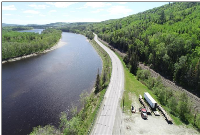
Figure 2 US 1 west of Frenchville.

The highway is also a 2021 U.S. Bicycle Route (USBR 501) designee, stretching from Bangor, Maine along the Saint John River to Allagash, 27 miles southwest of Fort Kent.