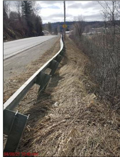
Figure 5 Compromised guardrail high above a steep slope along the road.

The Project’s safety features are critical to the road’s modernization efforts and the desire to close US 1’s final safety and sustainability gaps and build modern infrastructure with climate change resiliency in mind. Safety features will reduce both the number and severity of accidents in a region that sees 90 inches or more of average annual snowfall, including 30 days with a minimum of one inch of snow and 40–60 days of sub-zero temperatures each year. While these numbers contribute to the important winter tourism economy, they also present challenges for regional roadways and their users. 4 That’s why MaineDOT’s environmental project planning includes: