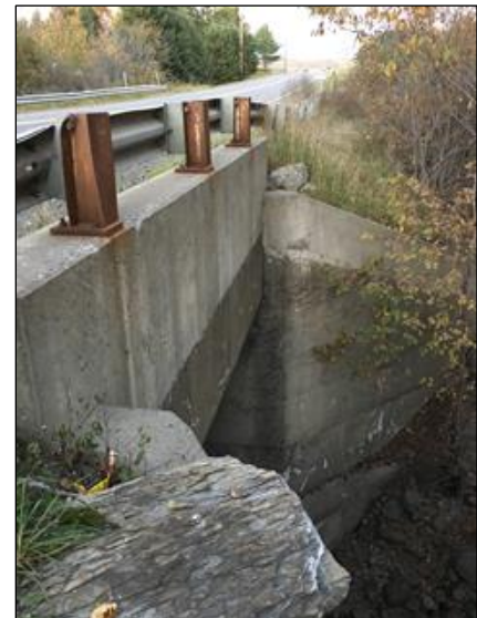
Figure 9 One of four large culverts along the Project area.

MaineDOT recently updated its Public Involvement Plan which outlines the department's efforts to ensure disadvantaged populations are afforded meaningful opportunities for public involvement. 24 Additionally, this Project ensures safe, efficient access for all users of the transportation system and by extending the service life of the existing infrastructure it avoids impacts outside the existing right-of-way, which have the potential to disproportionately impact