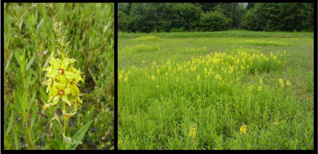
Yellow Loosestrife (early July—while the cranberries are in bloom) on a 1-acre cranberry bed in Washington County. This is the only bed belonging to this particular part-time cranberry grower, and one needs to look hard to be able to see any cranberries. Yellow loosestrife—considered a high priority weed—is a perennial, and its blossoms compete with the cranberry blossoms for pollinators.