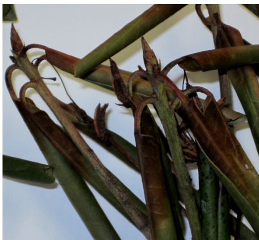
Winter injury on Rhododendron. (Maine Forest Service)

Winter Injury - Numerous cases of winter injury on Rhododendrons have been sent to the Lab in the past few weeks. Winter injury can be caused by any one of three general conditions; foliage desiccation, rapid temperature drops and low temperatures over an extended period of time. The temperatures through the winter season were lower than normal. However, in most areas they did not reach the extreme lows nor did rapid temperature drops occur which would result in severe winter injury. Rather, it was likely