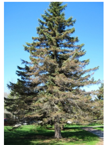
Spruce needlecast defoliation on white spruce.

Spruce Needlecast ( Rhizosphaera kalkhoffii ) - Spruce needlecast continues to cause widespread and serious injury to white and Colorado blue spruces throughout the state. Prolonged infections have resulted in severe dieback and mortality in ornamental and roadside plantings. Applications of protectant fungicides (chlorothalonil or copper-based) to current-season needles will protect the new foliage, but will not help needles already infected. Fungicides need to be applied just after budbreak (after the new buds lose the protective bud scale sheath in late May or early June), and again about two weeks later, when the needles are nearly full-grown.