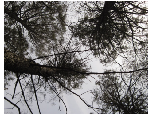
Crowns of declining hemlocks in Harpswell, ME.

Trees in Harpswell have shown a rapid progression of infestation (from undetectable to “plastered” in a couple of years). Some of the most severe decline also has been observed in this area as well as on other coastal peninsulas and islands. These locations seem to have a combination of climate and soils (or lack thereof) that contributes to a more rapid buildup of the insect and decline of the host than has been observed in southern York County.