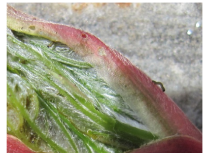
Winter moth larvae on maple bud. (Maine Forest Service)

Winter Moth ( Operophtera brumata ) – Winter moth larvae started emerging the last week of April and are feeding on oak, apple, maple, birch, blueberry and other deciduous trees and shrubs. As of this week larval counts in Harpswell, Cape Elizabeth, Kittery and South Portland indicate that the December snow and cold apparently did not reduce the populations significantly over last year. This, despite the fact that there was only one large moth flight night in 2013 versus nine nights in 2012. Expect heavy defoliation in areas that were hit by winter moth last year and more damage in surrounding areas as well: along the coast from Kittery to Rockland.