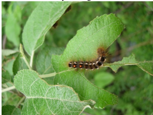
Browntail moth larva (Maine Forest Service)

Browntail moth larvae feed on the emerging foliage of oak, apple, birch, cherry, hawthorn, rose and other hardwoods. They emerge from their overwintering webs starting the end of April, even before the buds