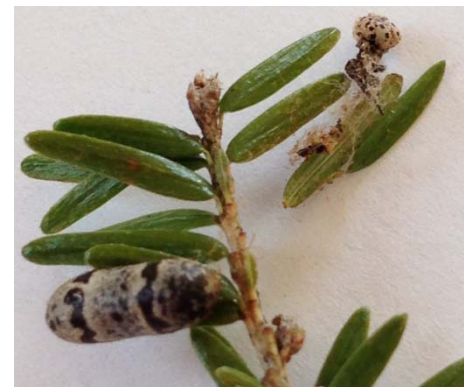
Ichneumon wasp cocoon on hemlock (lower left). Host caterpillar's head capsule is visible in upper right of photo.

Ichneumon Wasp Cocoon – A hemlock sample collected due to scale concerns revealed no scale—the suspect marks were wounds in the needle tissue—but did have a beautiful reminder of the many insects working in beneficial roles in our forests. Eisman and Charney, in Tracks and Signs of Insects and other Invertebrates (2010), identify these “Easter egg” cocoons as structures created by ichneumon wasps in the Campopleginae subfamily. If you’re like me, once you see a picture of one, you’ll notice them everywhere you go in the woods.