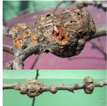
Gouty oak gall on red oak twigs. Smooth adult wasp emergence holes and ragged openings indicating predation are visible in the top photo.

In eastern Massachusetts forest health workers, entomologists, arborists and others are puzzling over the outbreak of a cynipid gall wasp, causing widespread defoliation and branch dieback as well as some tree mortality. Although this has been tentatively identified as the same species that caused oak decline in Long Island in the 1990's, the crypt gall wasp ( Bassettia ceropteroides ), so little is known of the group that this identity is not certain. However, this is certainly a wasp (whatever its name is!) to be on the lookout for in Maine's coastal oaks.