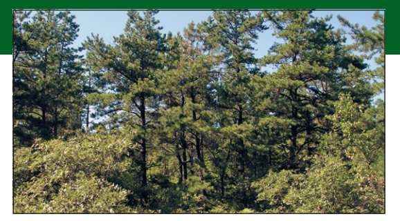
Pitch Pine - Scrub Oak Barren

- Pine Forest. Because of fire suppression in the last century, this community type has become very rare. Relatively large areas are required to maintain this dynamic community and its associated rare animal species. Most of the large sites in the state have been fragmented by permanent conversion to residential areas or to sand and gravel pits.