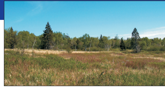
Tall Grass Meadow

sedge (>30%). Mixed Graminoid-Shrub Marshes also can be floristically similar, but are not strongly dominated by bluejoint grass (usually <20%, rarely up to 50%). Other open non-peat wetland types are shrub dominated, not herb dominated.