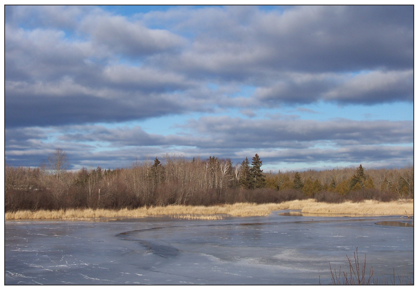
Aroostook River, Gene Cyr

This area includes Significant Wildlife Habitat for inland wading birds and waterfowl. Land managers should follow best management practices with respect to forestry activities in and around wetlands, shoreland areas, and Significant Wildlife Habitat. Vegetation removal, soil disturbance and construction activities may require a permit under the Natural Resources Protection Act. Contact the Maine Department of Inland Fisheries and Wildlife for more information.