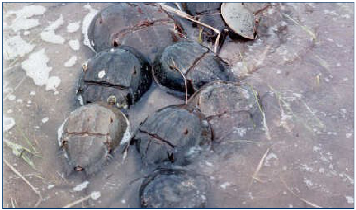
Horseshoe crabs, Pete Thayer