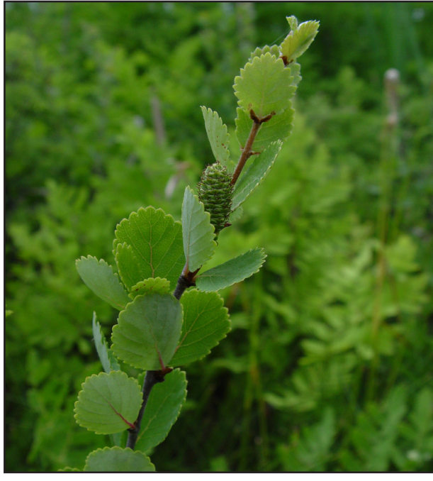
Swamp Birch, Maine Natural Areas Program