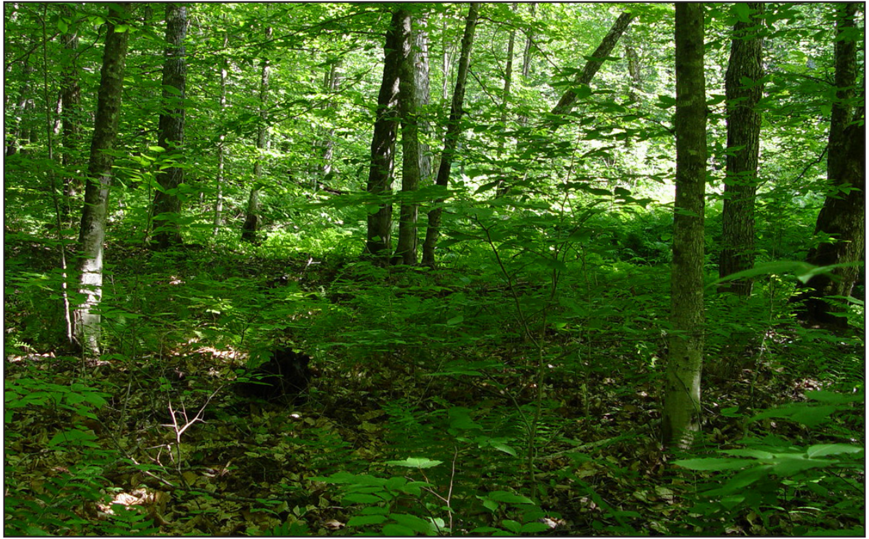
Wassataquoik Ecoreserve, Maine Natural Areas Program