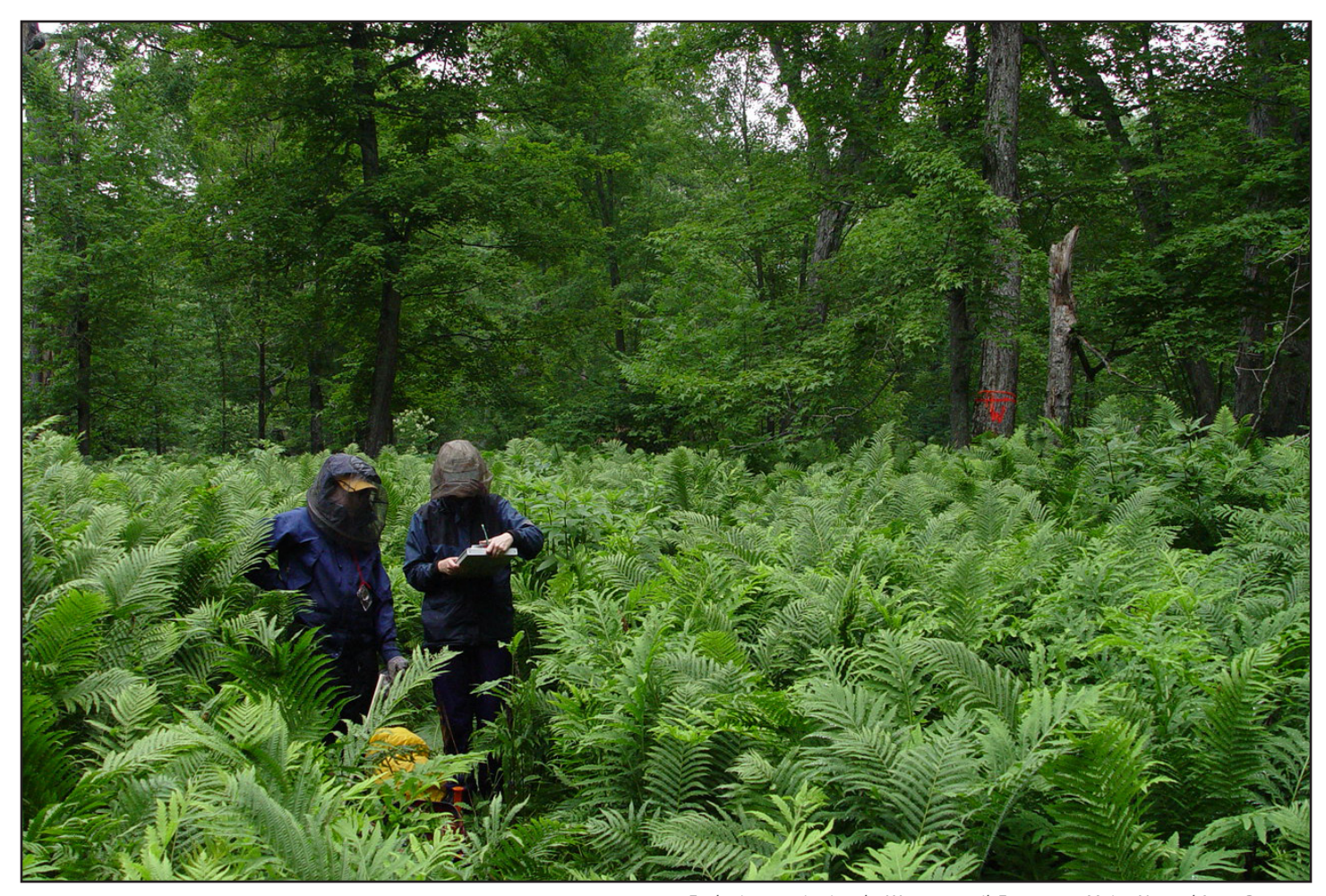
{\it Ecologists monitoring the Wassataquoik Ecoreserve, Maine Natural Areas Program}