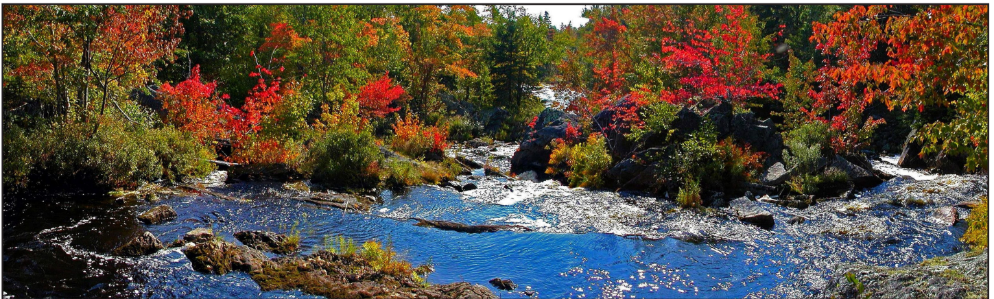
Pleasant River, Craig Snapp

For more information about Focus Areas of Statewide Ecological Significance, including a list of Focus Areas and an explanation of selection criteria, visit www.beginningwithhabitat.org