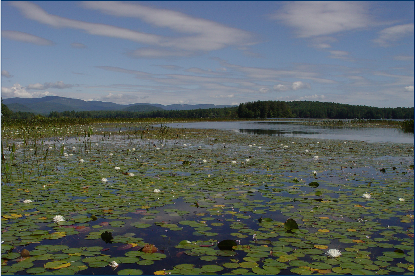
Kezar Pond Outlet, Maine Natural Areas Program