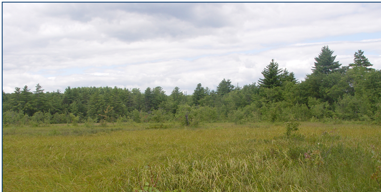
Kezar Pond Fen, Maine Natural Areas Program