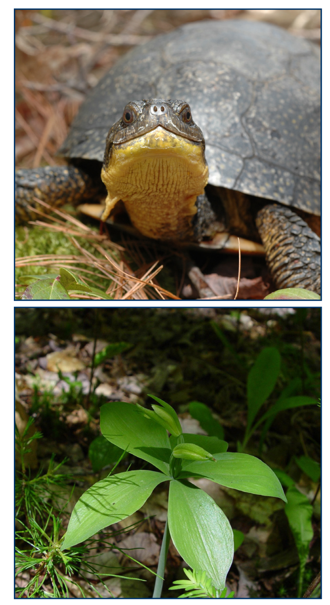
Top-Blanding's Turtle, Jonathan Mays Bottom- Small Whorled Pogonia, Maine Natural Areas Program

» Wetlands and Aquatic Systems: The integrity of wetlands are