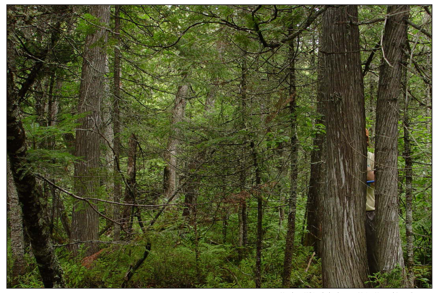
Northern White Cedar Swamp, Maine Natural Areas Program