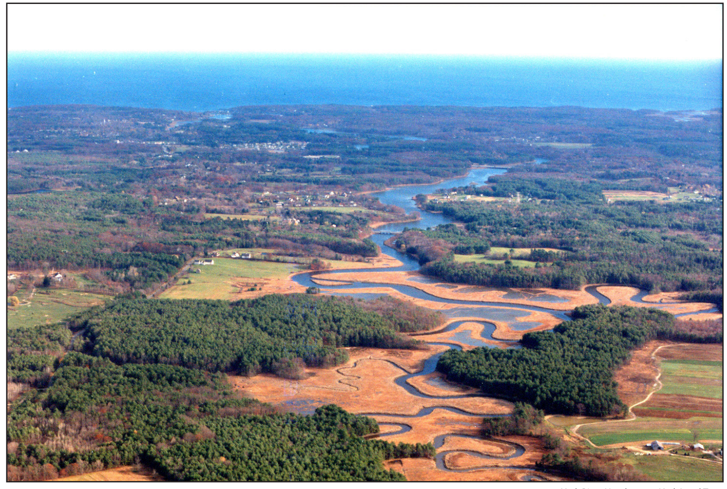
York River Headwaters, York Land Trust