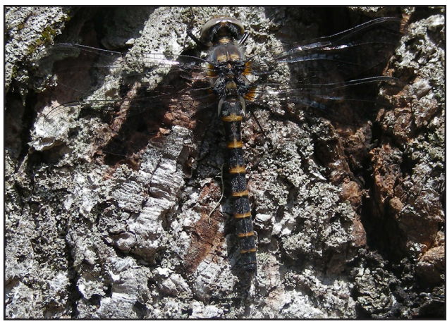
Ringed Boghaunter

celerated in the area and may threaten the population. This species is currently listed as state threatened in Maine because of its limited range and number of populations and close association with smaller wetlands that do not receive adequate protection under the state's wetland protection rules.