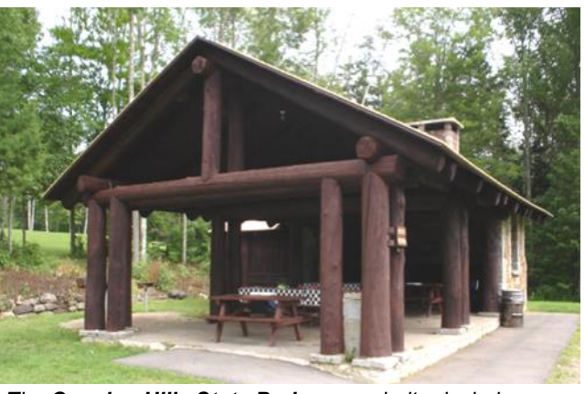
The Camden Hills State Park group shelter includes a large stone fireplace and outdoor barbeque grills. Eight picnic tables seat approximately 50 people. The area is recently restored, with views of Penobscot Bay.