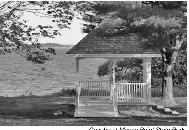
Gazebo at Moose Point State Park