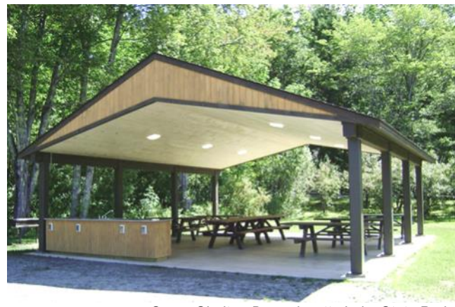
Group Shelter, Damariscotta Lake State Park