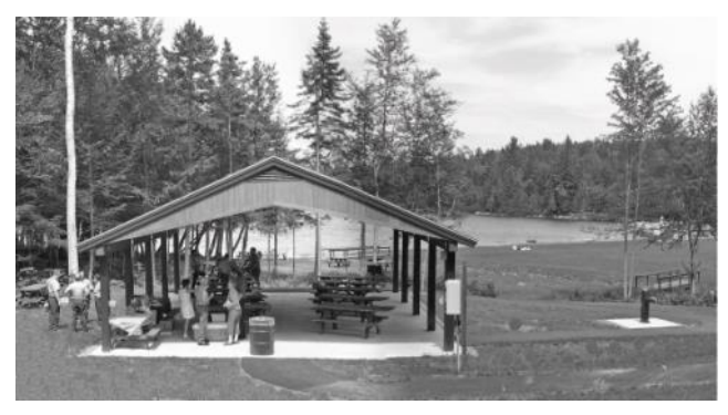
The Peaks-Kenny State Park group shelter provides seating for 60, a large barbeque grill, and electric outlets for appliances and electronics. This site has been constructed with special access and parking for visitors with disabilities, and is immediately adjacent to the park's beach area.

Reservable group areas, without shelters, are available at Range Ponds, Sebago, Crescent Beach, Two Lights, Cobscook Bay and Lamoine State Parks. In addition to the per-person day use fee, there is a $35.00 non-refundable reservation fee for these areas.