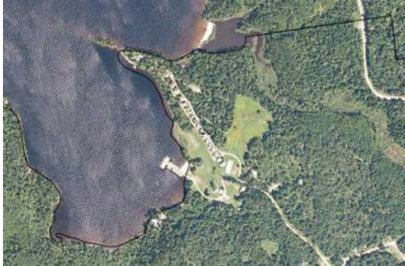
South shore of Kennebago Lake, with camp leases

The Unit also contains most of the shoreline of Flatiron Pond, a 30 acre shallow pond in the southwest corner of the Unit. The Pond supports a number of native fishes, including blacknose dace, brook trout, creek chubsucker, and rainbow smelt (PEARL database). Water quality in Flatiron Pond is good for coldwater game fish