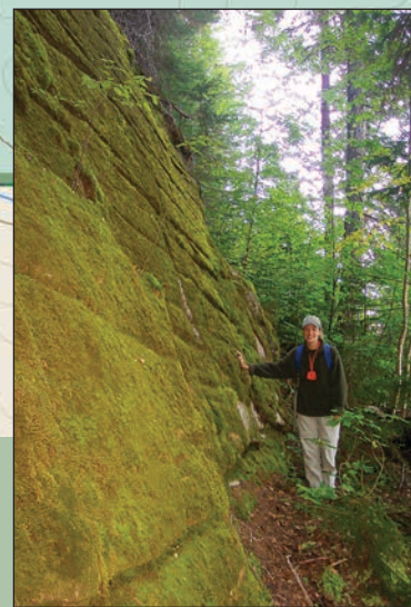
Talus slopes are one of Deboullie's notable features.