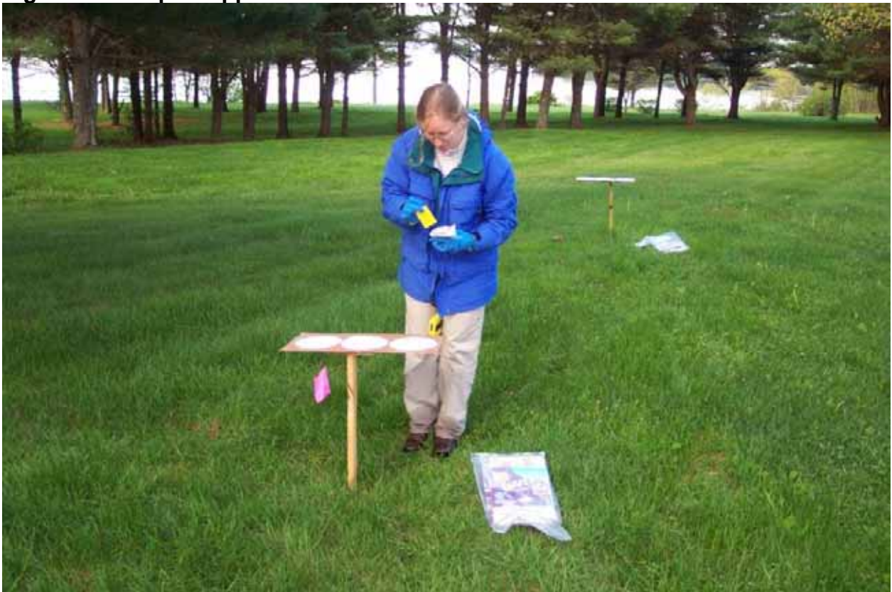
Figure 8. Freeport drift cards.