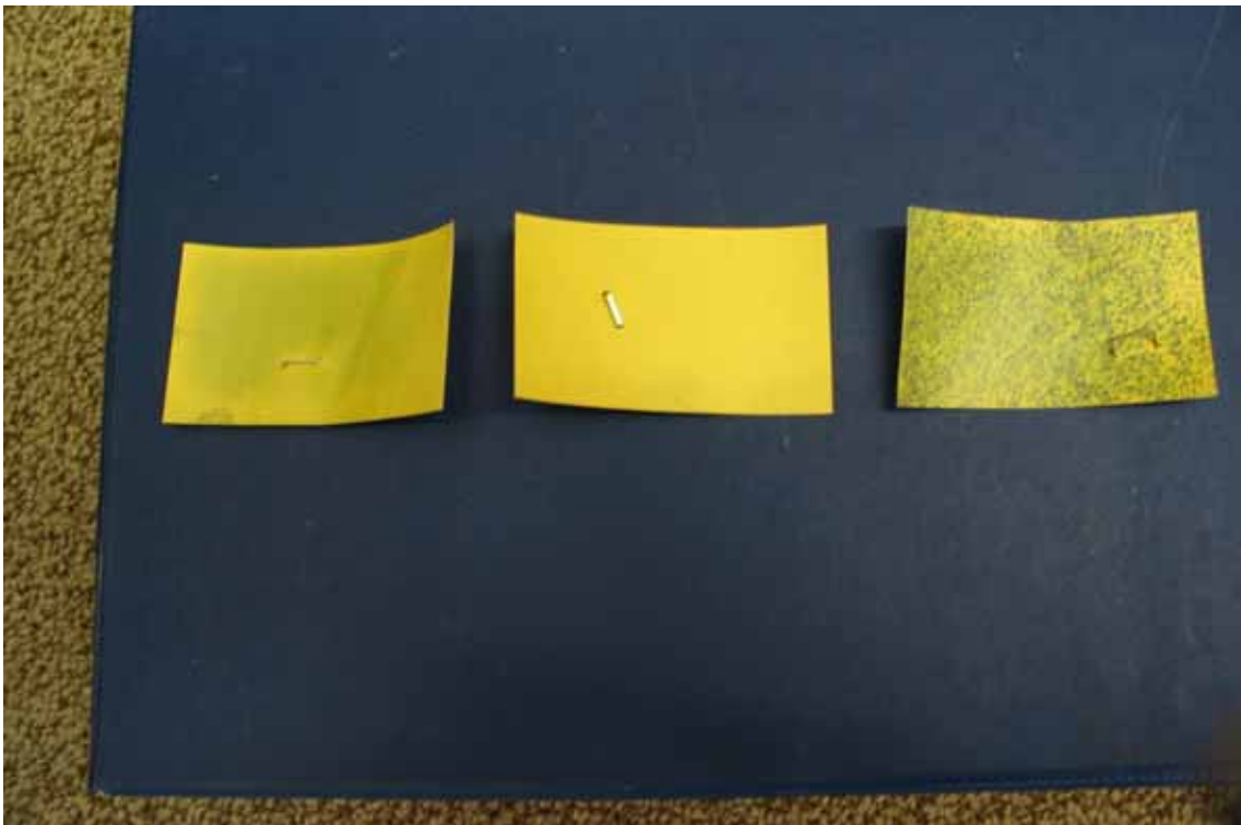
Figure 12. Water sensitive cards from the Freeport site from left to right: 250', 150', and 50' downwind from target. Very small liquid droplets are just barely visible on the yellow cards that were 250' and 150' from the target.