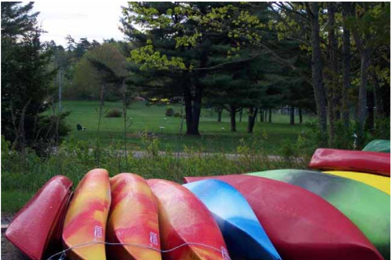
Figure 10. Freeport drift cards set up across lawn. Pine trees may have caught some drift before it reached cards.