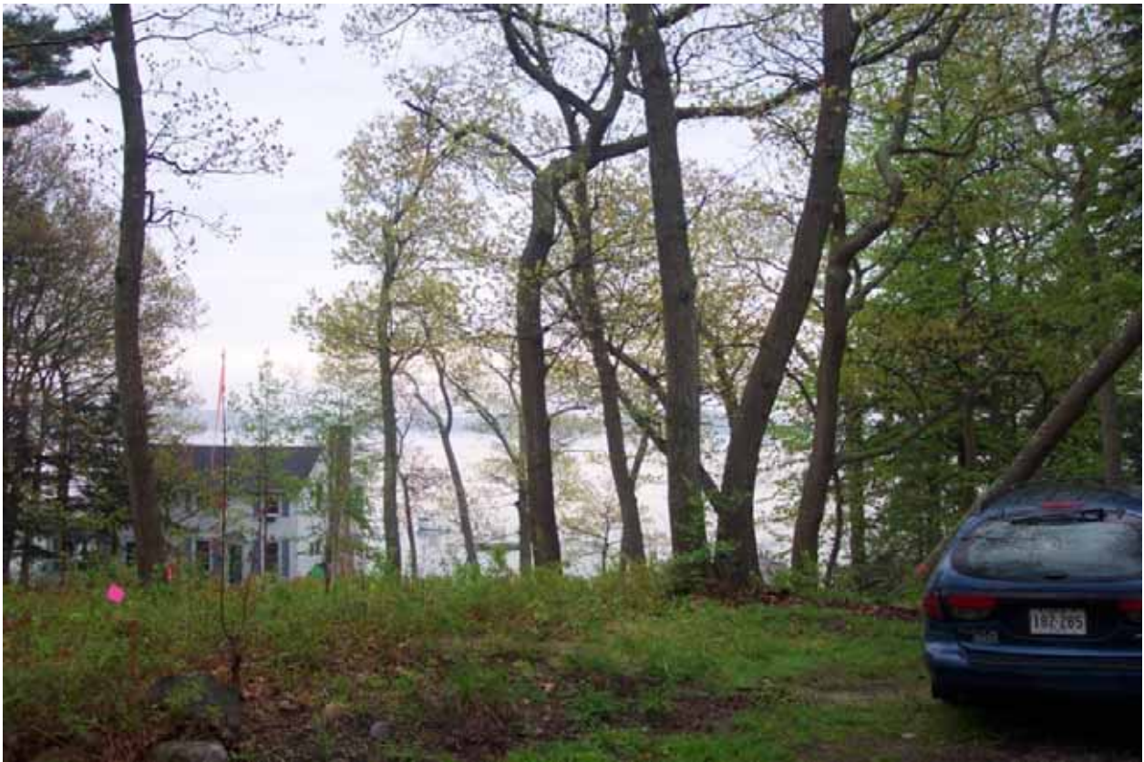
Figure 3. Falmouth target area is three trees about 50' from water and drift cards were set up further away from the water (down wind), and at water's edge.