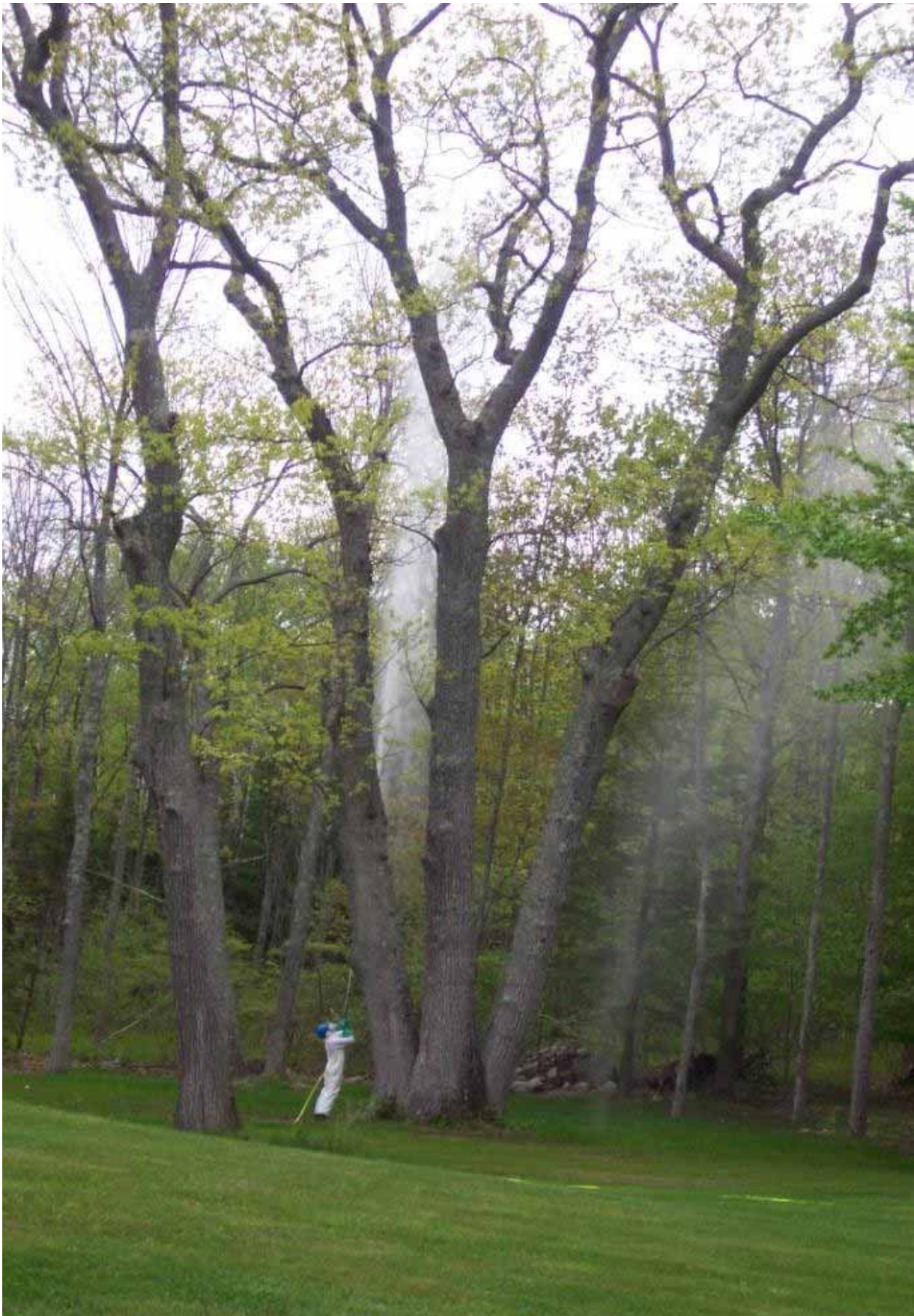
Figure 5. Harpswell application.