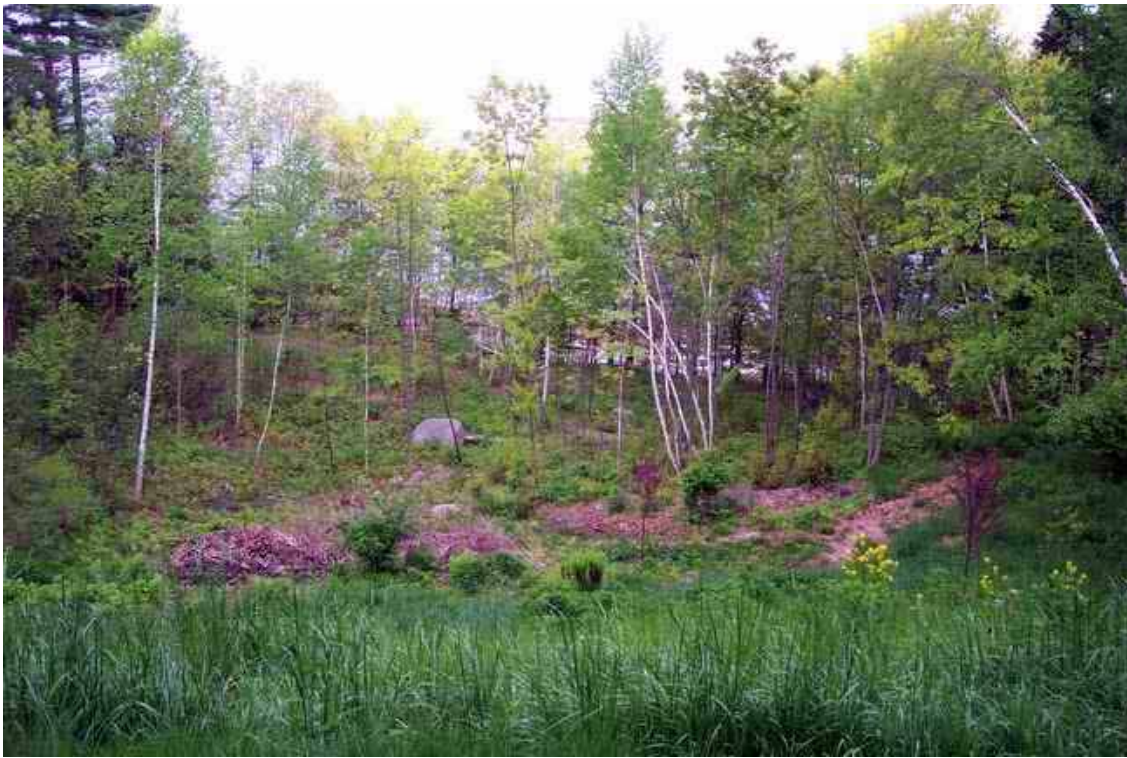
Figure 11. Yarmouth drift cards set up in this area. Ocean is down this hill over 250' from target area. Slight movement of air toward the water during this spray event.