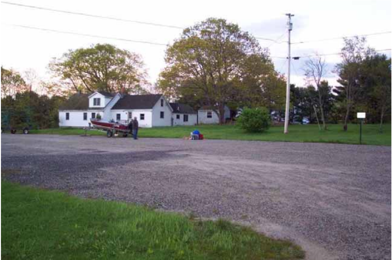
Figure 6. Freeport target area is trees around house, all greater than 250' from water.