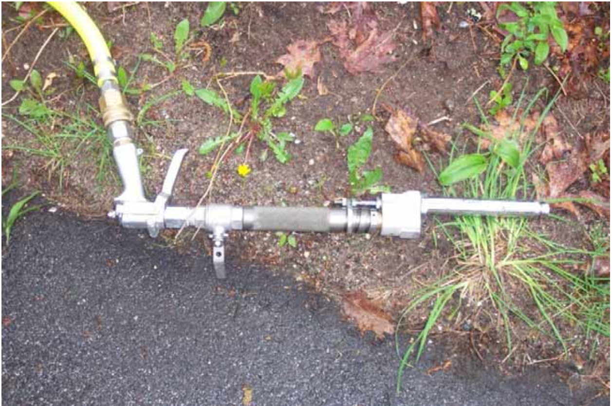
Figure 2. Nozzle used in Falmouth.