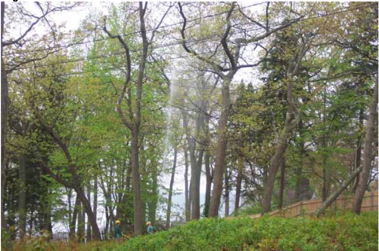
Figure 4. Falmouth application.