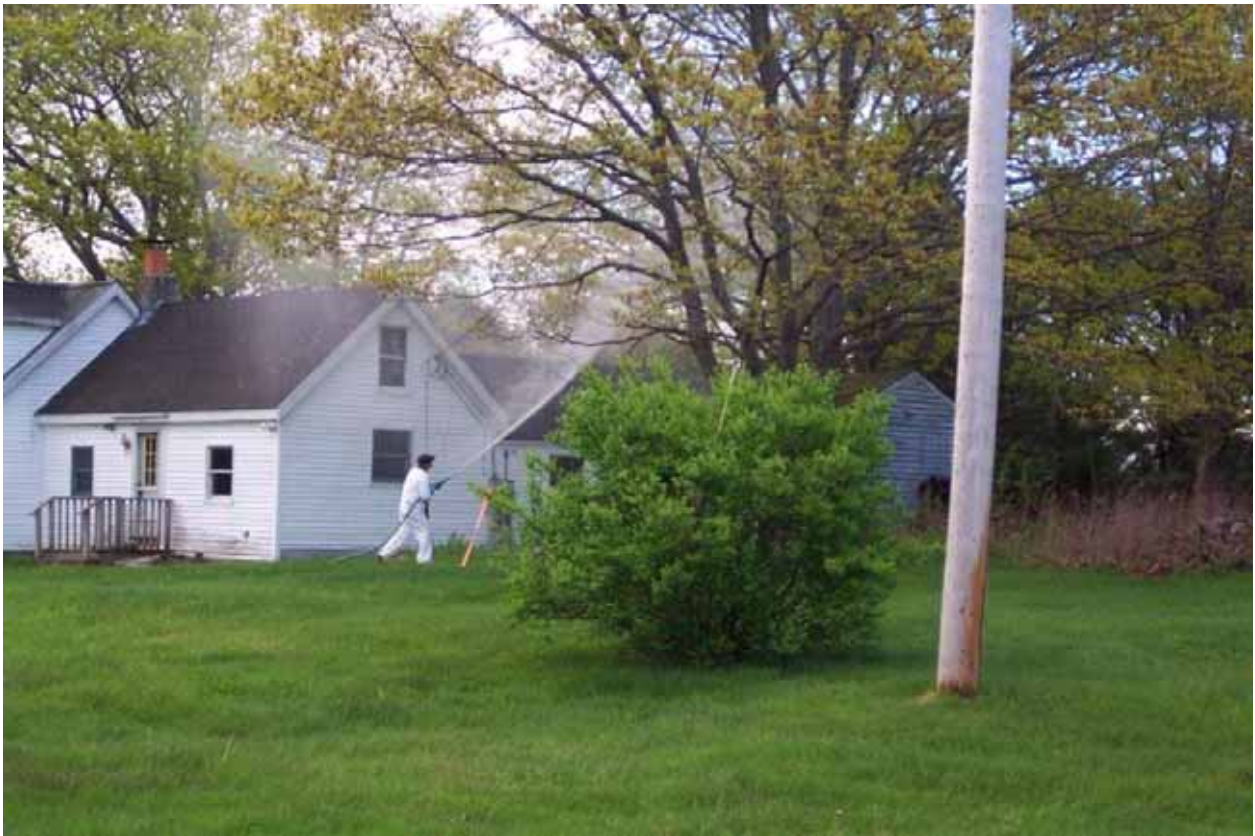
Figure 7. Freeport application.