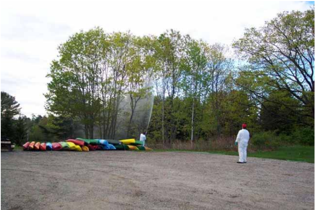
Figure 9. More Freeport application. Sprayer pointed toward drift cards.