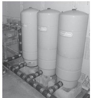
Example of Pressure Tanks: Note only one pipe serves as both inlet and outlet, no separate outlet