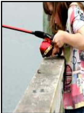
Campers fishing of from the Pier!

Situated in the heart of Boothbay Harbor, Burnt Island Lighthouse has stood the test of time in protecting our special place on the coast of Maine. Sporting the oldest original lighthouse tower in Maine, Burnt Island provides an exciting place for campers to explore tide pools, go fishing, visit a working lighthouse, and with our team of educators on hand- immerse themselves in a variety of marine and terrestrial science activities. Of course we couldn't forget more traditional camp activities like crafts, games, and free time! Burnt Island provides a truly unique space for hands-on learning, free from the distractions of mainland living.