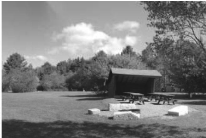
Lamoine State Park, Group Campsite "B"

Lamoine State Park: Two group sites can be combined to accommodate tenting groups up to 60 campers. For more info please call: 207-667-4778 (April–Oct) or 207-941-4014 (Nov–March).