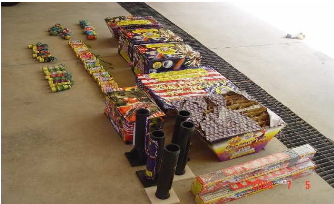
This assortment of Fireworks was seized coming into Maine from NH.

Being near July 4 th I thought it'd be appropriate to summarize again the dangers fireworks pose to Maine citizens and visitors alike. Despite being illegal in Maine, we need to be mindful that fireworks are available just across the border as the picture below illustrates.