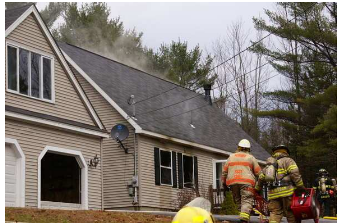
Norway Firefighters suppress a home fire

started. You can see a picture of the home in the photo below.