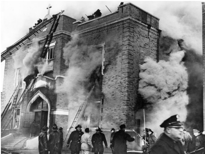
Our Lady of Angels Fire, December 5, 1958 Chicago, Illinois

This fire may perhaps be the most tragic fire in American history for two reasons: 92 children were killed and they were killed because essentially the school was not legally bound to comply with all 1958 fire safety codes due to a grandfather clause in the 1949 standards. Each classroom door had a glass transom above it, which provided ventilation into the corridor and also permitted flames and smoke to enter once heat broke the glass. The school had one fire escape. The building had no automatic fire alarm, no rate-of-rise heat detectors, no direct alarm connection to the fire department, no fire-resistant stairwells, and no heavy-duty fire doors from the stairwells to the second floor corridor. At the time, fire sprinklers were primarily found in factories or in newer schools, and the modern smoke detector had not yet become commercially available (that didn't happen until 1969). All these inadequacies were known in 1958 but not corrected.