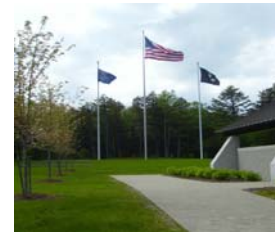
83 Stanley Rd Springvale, ME