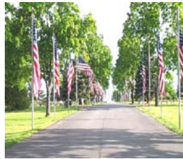
Civic Center Dr Augusta, ME