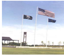
37 Lombard Rd Caribou, ME