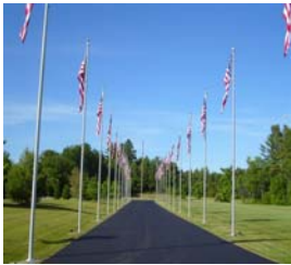
163 Mount Vernon Rd Augusta, ME