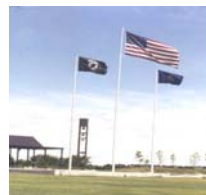
37 Lombard Road Caribou, ME