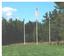
163 Mount Vernon Road Augusta, ME