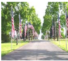
Civic Center Drive Augusta, ME