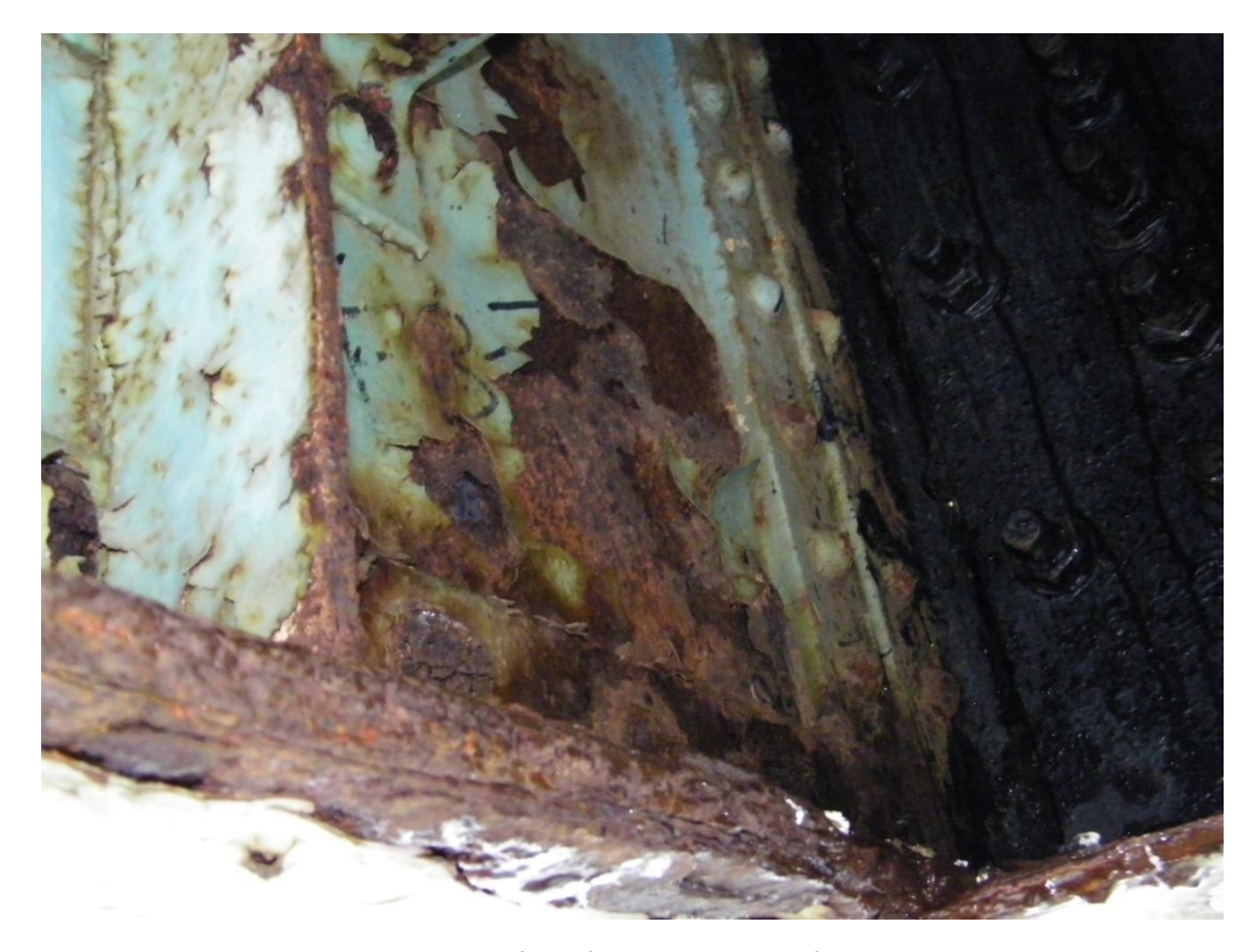
Span 1, Floorbeam 6, North Face Typical condition in roadway floor beams near chords