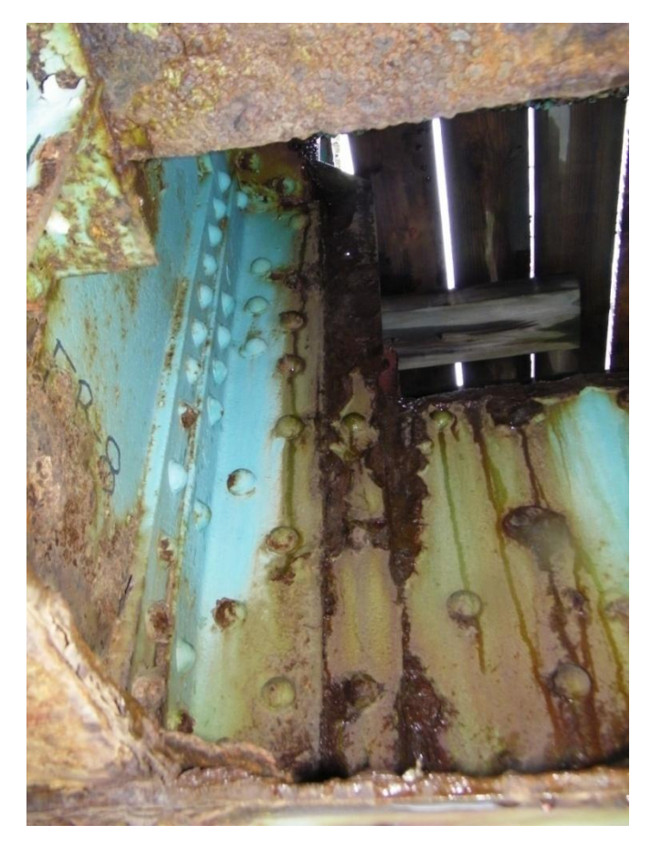
Span 1 Gusset Plate L7 East Roadway floorbeam/bottom truss chord connection - wooden sidewalk walking surface above