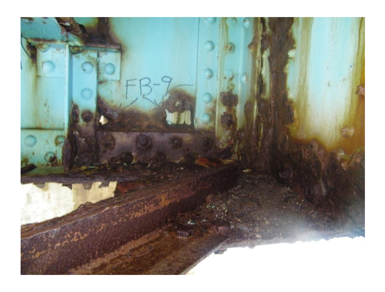
Span 3 Floorbeam 9, South Face, East End Heavily deteriorated with holes in web of roadway floor beam Roadway Floorbeam has been previously repairs as evidenced by bolts.