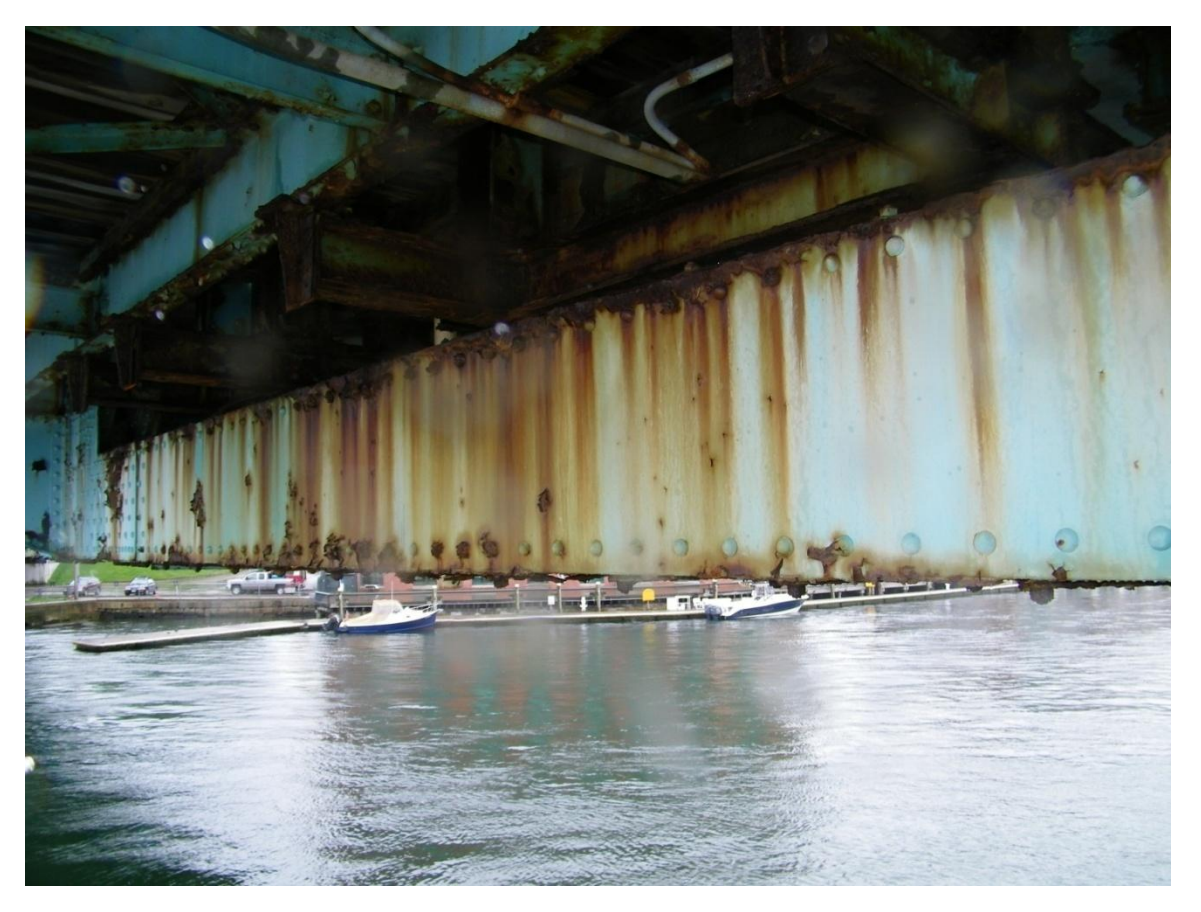
Span 1 Bottom Chord L8-L9, East Exterior Face Typical Condition at Fixed Span Bottom Chords between panel points