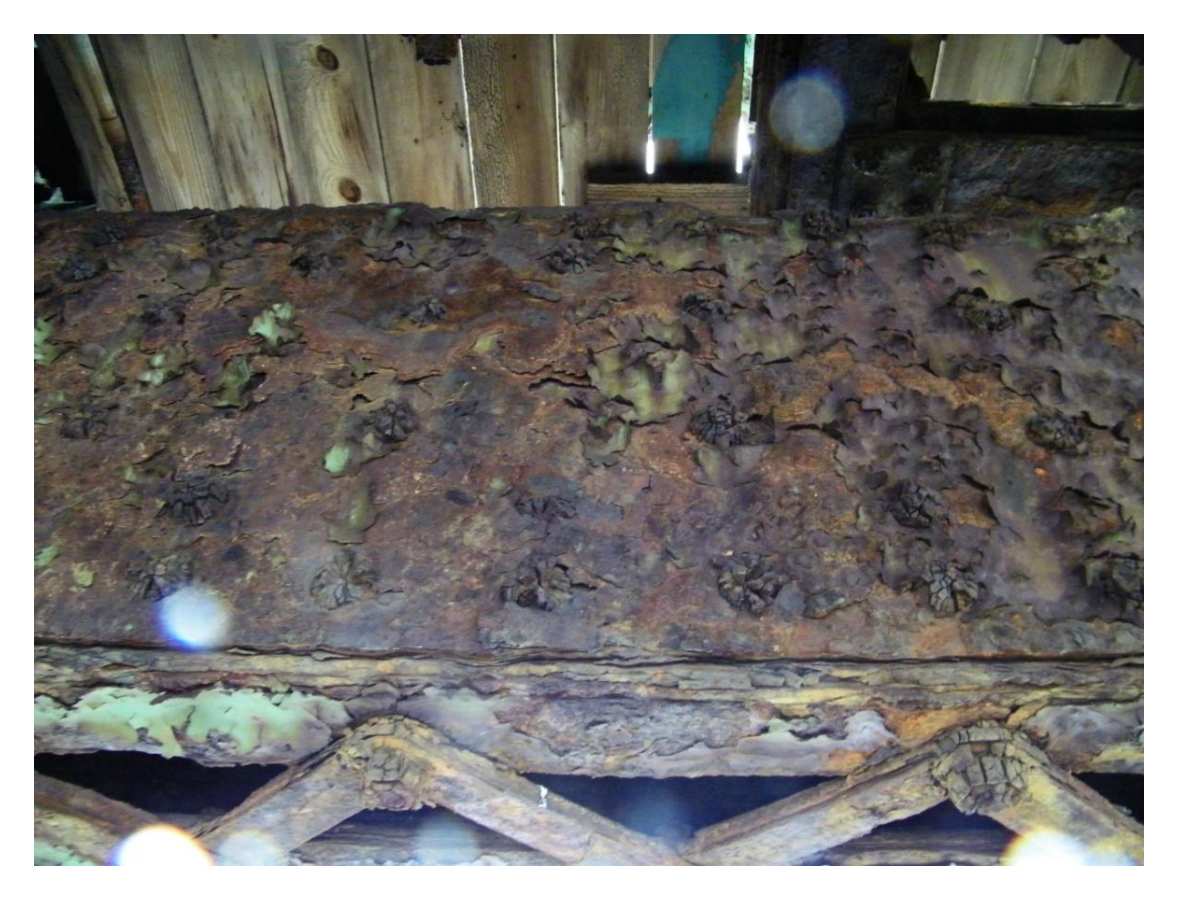
Span 2 Severe deterioration on bottom Chord L5-L6, Interior Face with wooden sidewalk walking surface above