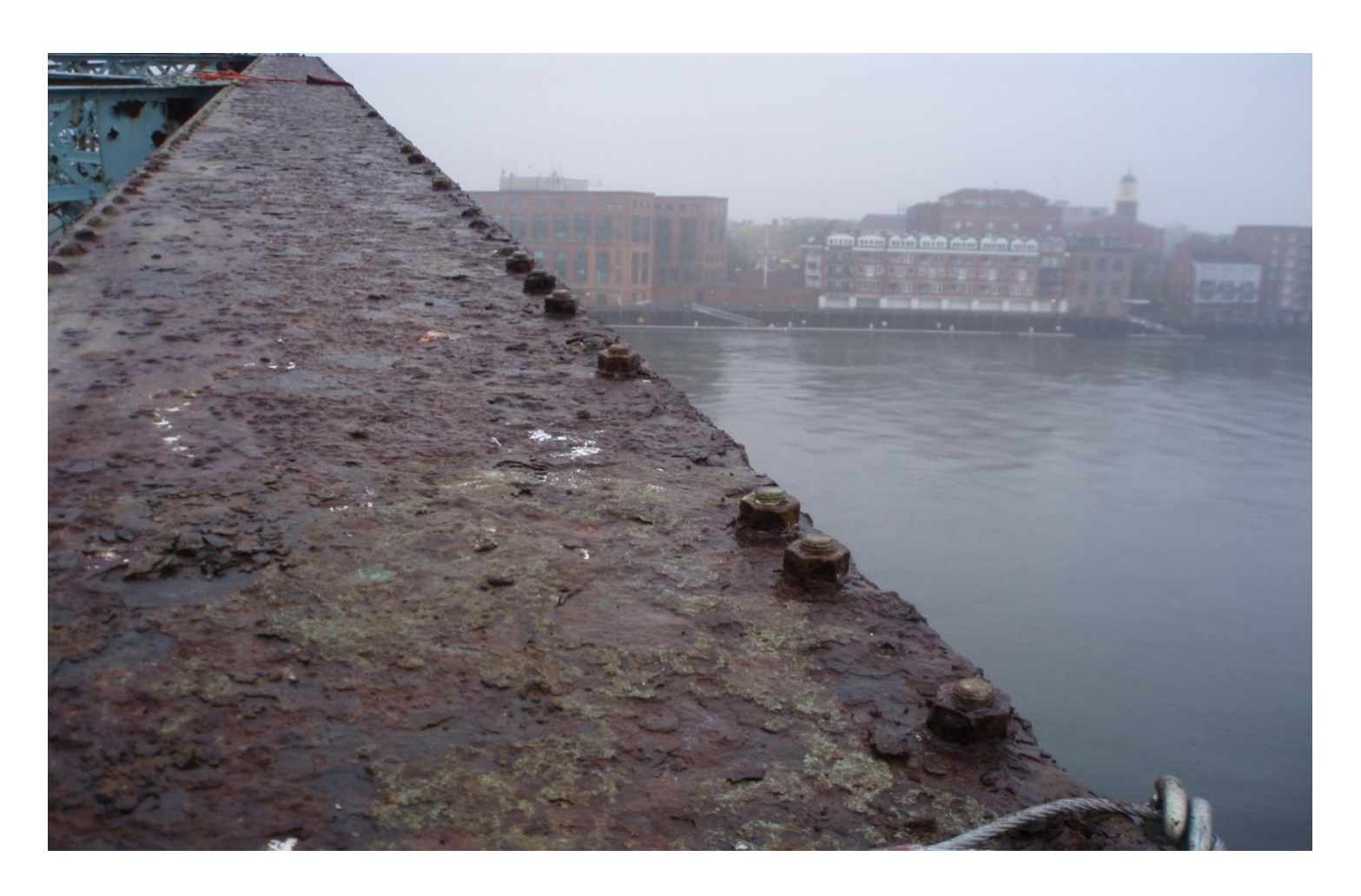
Top chord looking south from U2 looking towards Portsmouth. Rivets replaced by bolts in previous repair. Gaps between bolts suggest severely deteriorated rivet heads