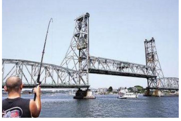
Bridge opening for commercial fishing boat

Commemorative WW I plaque on South end of Memorial Bridge in Portsmouth NH