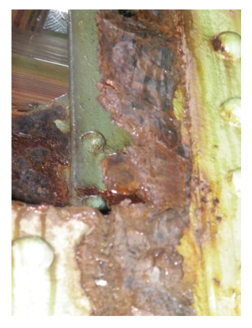
Span 3 Gusset Plate L3 East Interior with severe section loss Roadway beam (right) framing to the bottom truss chord (lower left)