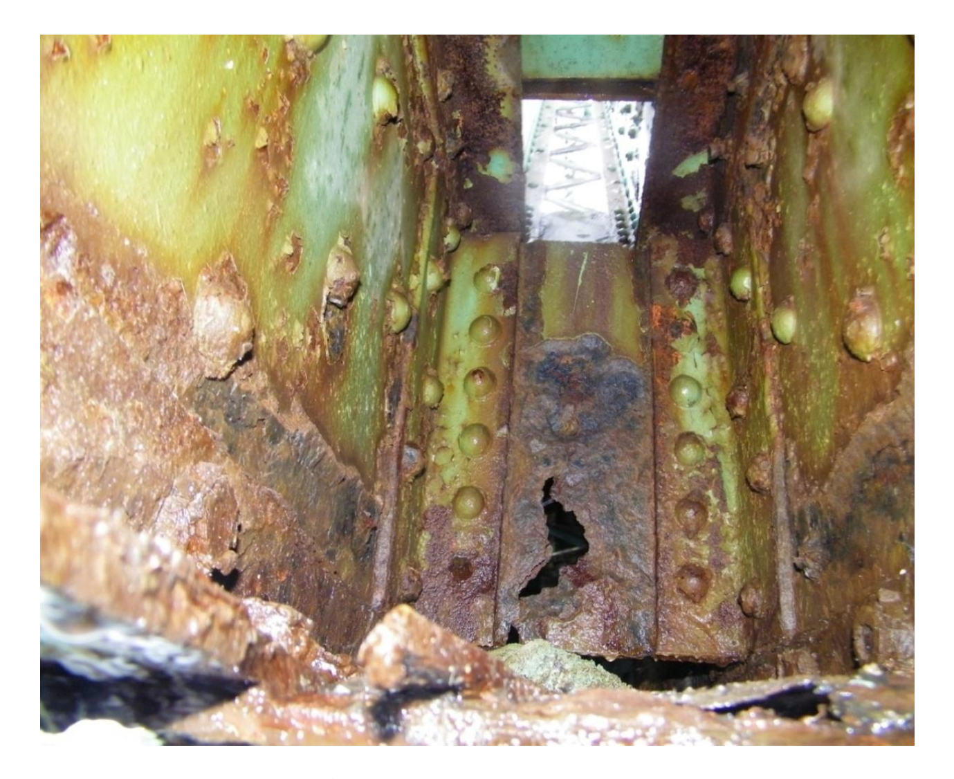
Inside of Chord at Gusset L9 in Span 3. Deteriorated lacing in the foreground and a deteriorated internal stiffener plate center. Truss diagonal seen just above internal stiffener plate