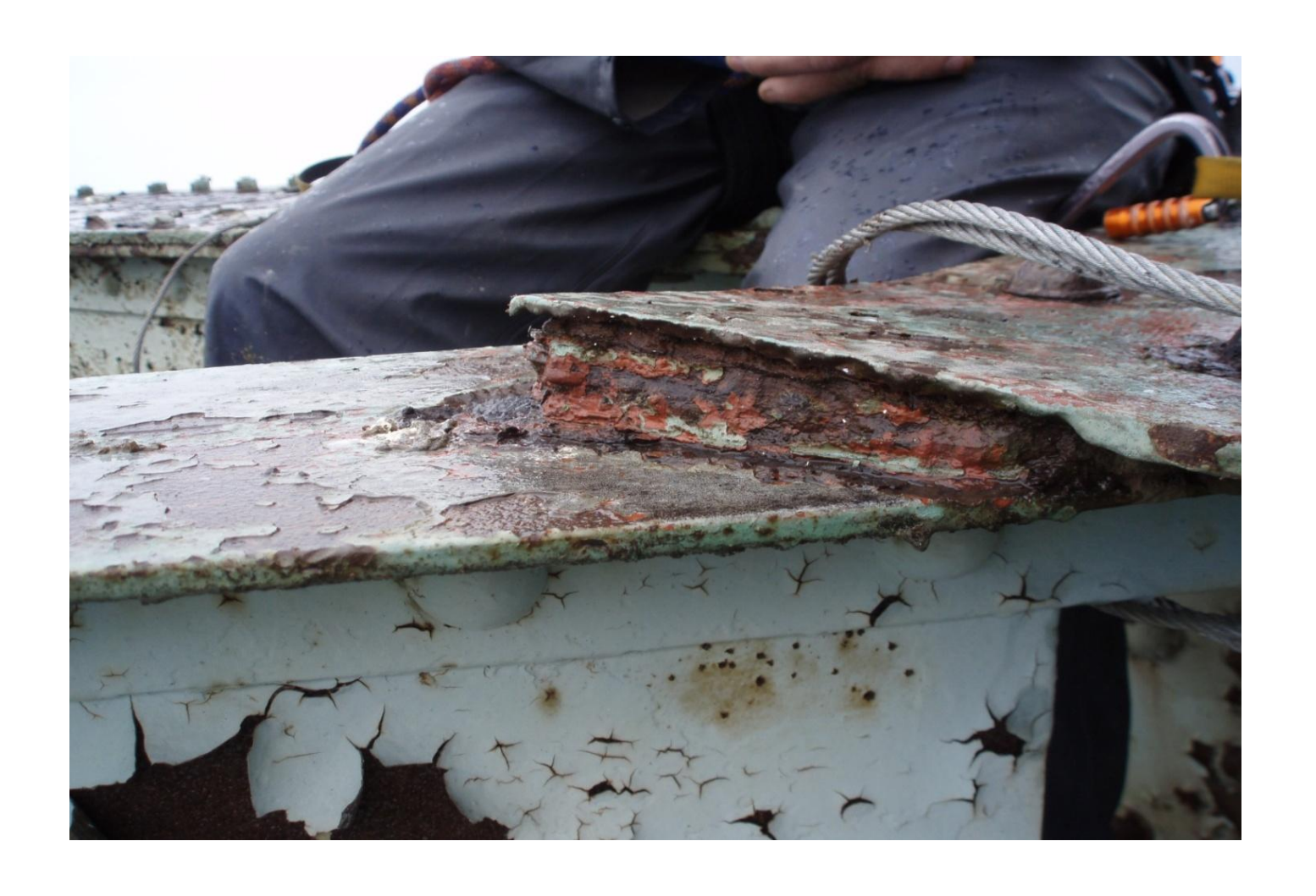
U1 Lateral bracing on top chord, typical example of 1"pack rust between gusset plate and framing members