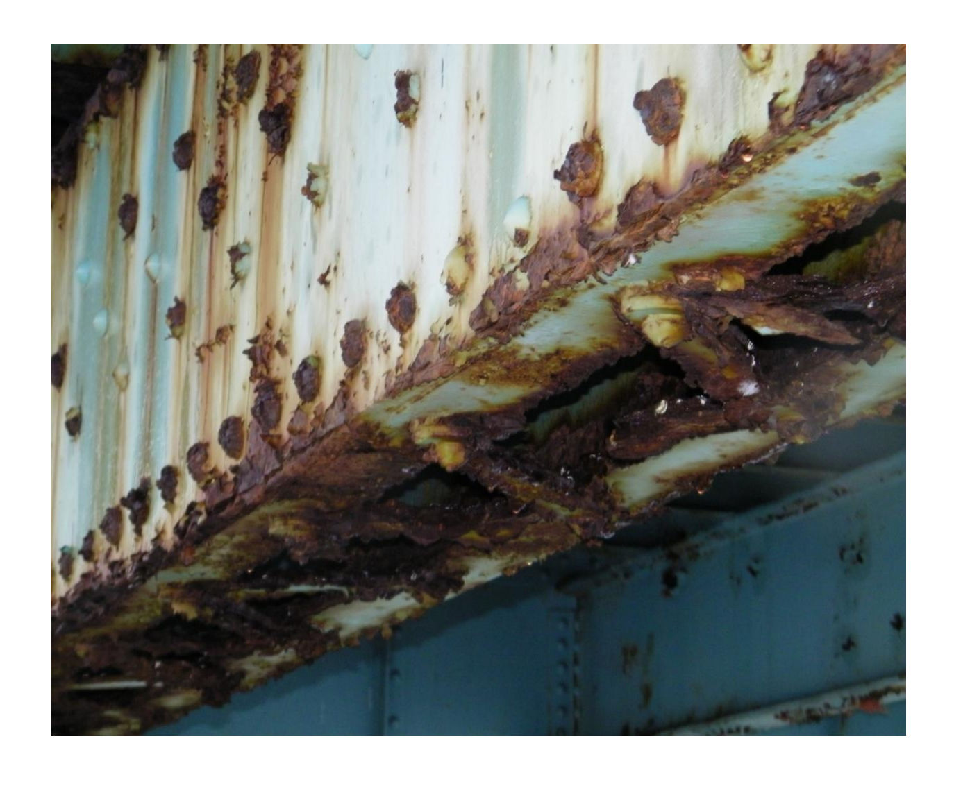
Span 3 Bottom Chord L3-L4, West Exterior Face Typical Lacing and rivet head Deterioration