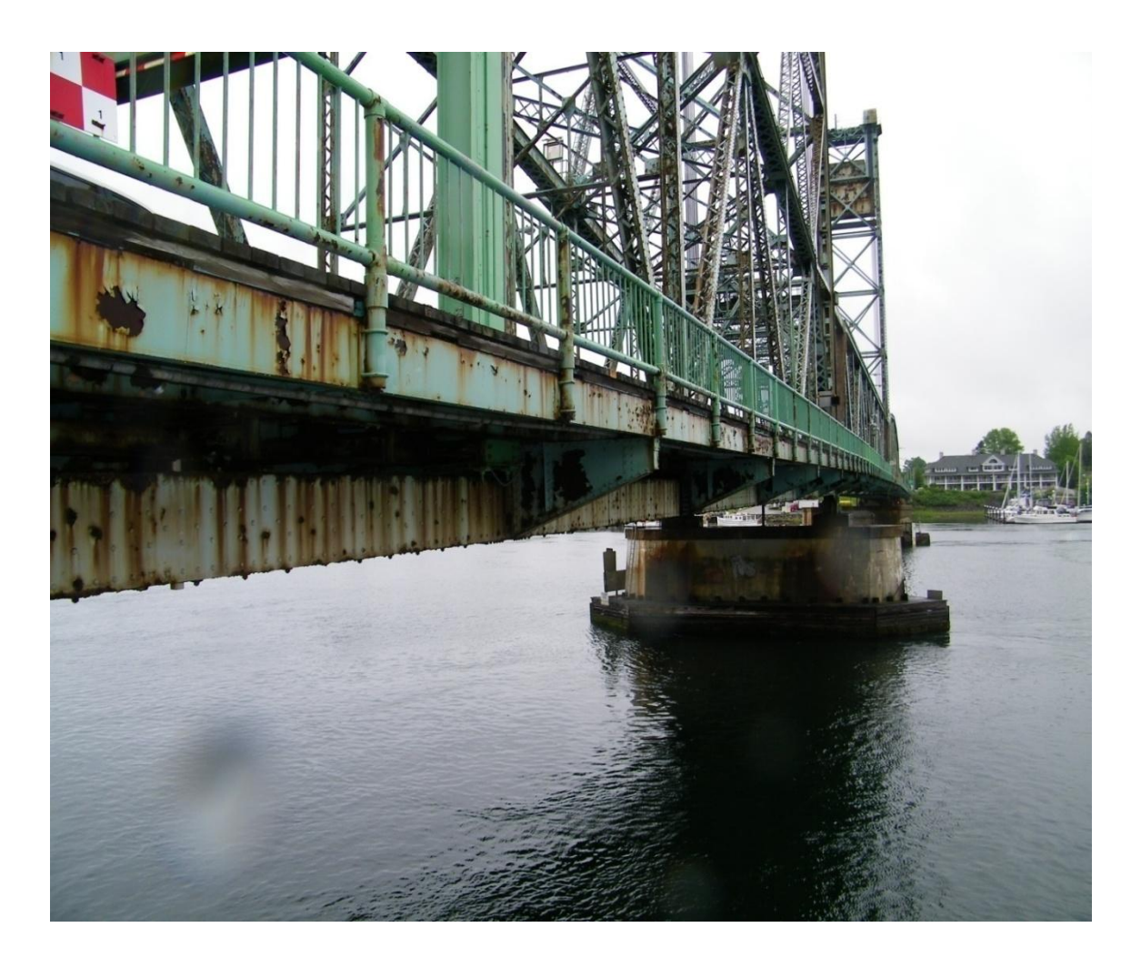
Span 1 Bottom Chord L4-L5, East Exterior Face Typical Fixed Span Bottom Chord Condition between truss panel points