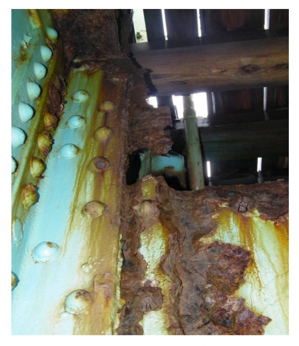
Span 3 Gusset Plate L9 East Interior face of bottom chord with severe deterioration