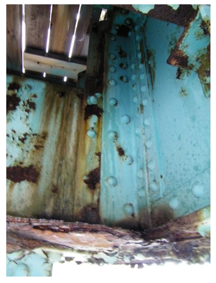
Span 1 Gusset Plate L7 East horizontal gusset plate between roadway floor beam and the fixed span truss bottom chord.