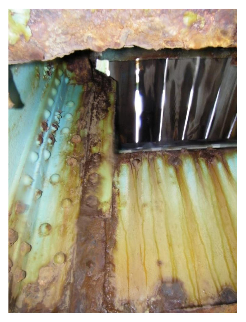
Span 1 Gusset Plate L9 East with repair, plate from previous repair Roadway floor beam (left) framing into interior face of bottom truss chord (right)