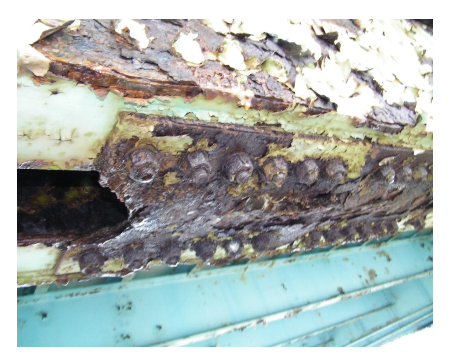
Span 3 Bottom Chord L3-L4, West Exterior Face