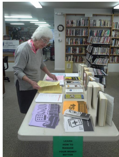
Lady browsing financial literacy materials