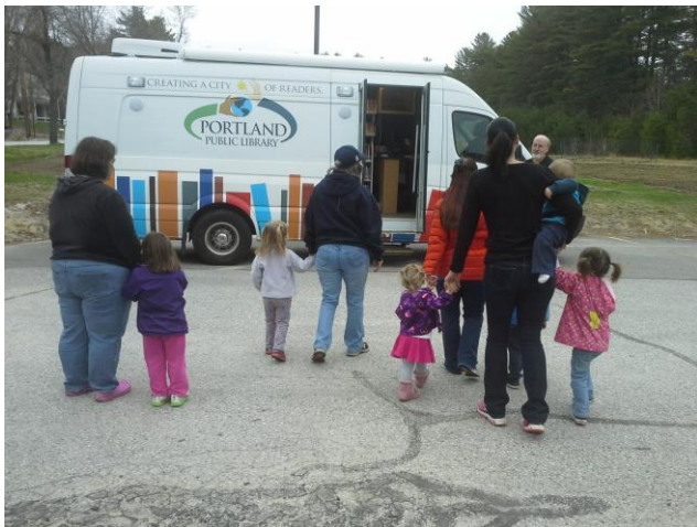
Moms and kids visiting the PPL bookmobile at Raymond Village Library