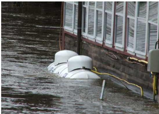
Hallowell April 2005, LP tanks not anchored and susceptible to flow.

Other hazards to be cautious of are storage tanks, lumber, and similar buoyant materials. If not properly anchored, these items can become floating debris that will abut buildings or bridge openings downstream causing blockage of flood flows and increased flood heights.