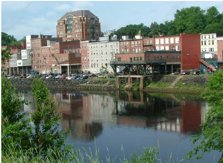
(Augusta, ME) Commercial areas in older towns are often located on rivers. Floodproofing is an option for commercial buildings.

One of the key purposes of floodplain regulation is to prevent construction projects similar to those that have created problems in the past. This is done by withholding the development permit until the project plans are reviewed to ensure that there is no obstruction to flood flow, increases to flood heights, or increased flood damages being created.