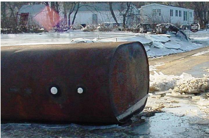
Canton, ME Flood December 18, 2003 Caution should be exercised when working near a damaged tank. Such a structure may be particularly hazardous when it has been loosened from its anchor during a disaster.

Increased flood height is not the only potential flood-related hazard that can result from floodplain development. Although Article VI of the Model Ordinance does not prohibit the placement of chemicals, explosives, buoyant materials, or other hazardous materials below the flood protection elevation, a community should take steps to assure that places that store or use hazardous material are properly mitigating flood damages either by using floodproofed storage facilities like tanks or in places otherwise protected. It may be wise to completely prohibit such materials in the SFHA. From the U.S. Corps of Engineers book, Floodproofing Regulations , two lists of examples have been developed: