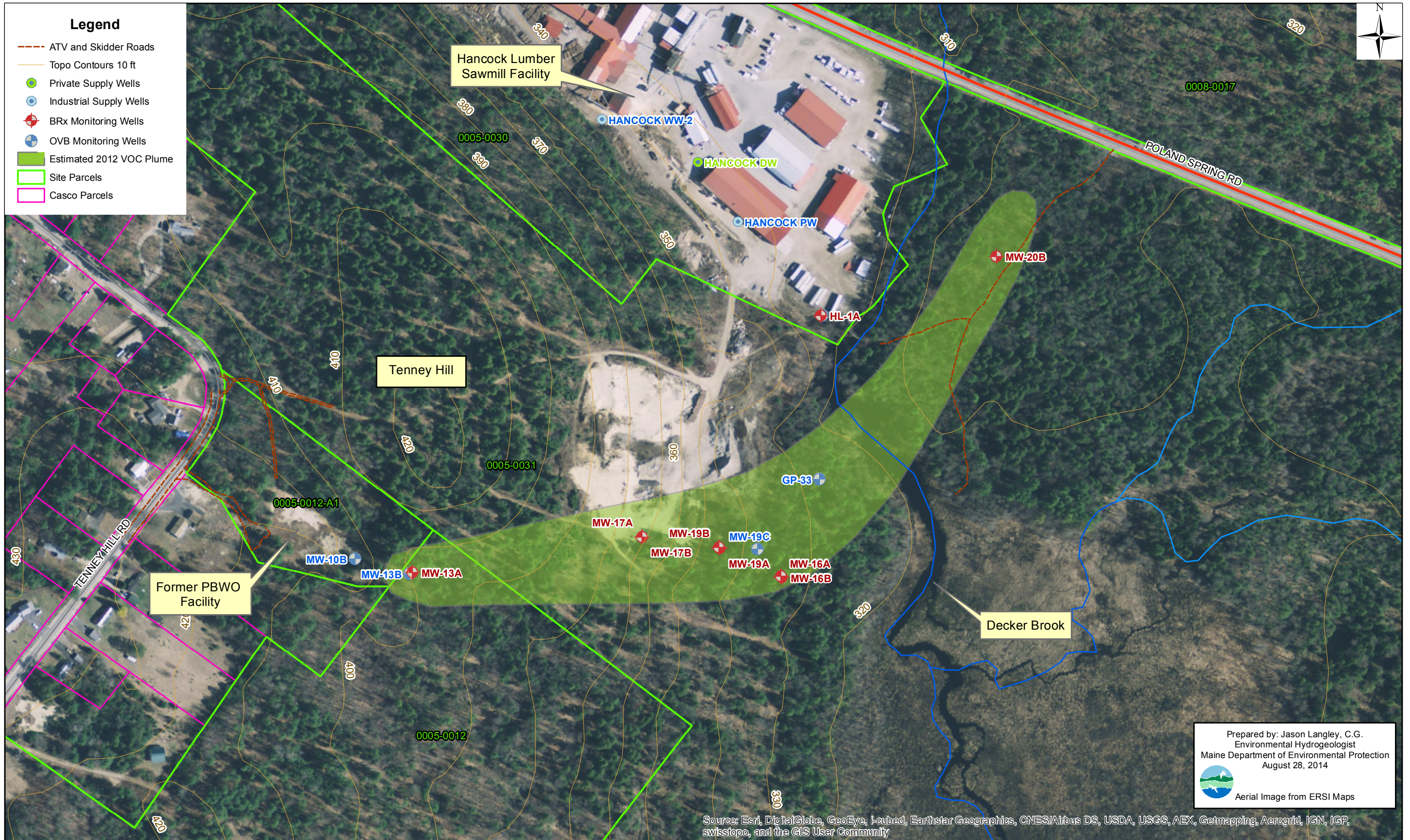
Figure 1: Portland Bangor Waste Oil Casco Long Term Monitoring Site Plan