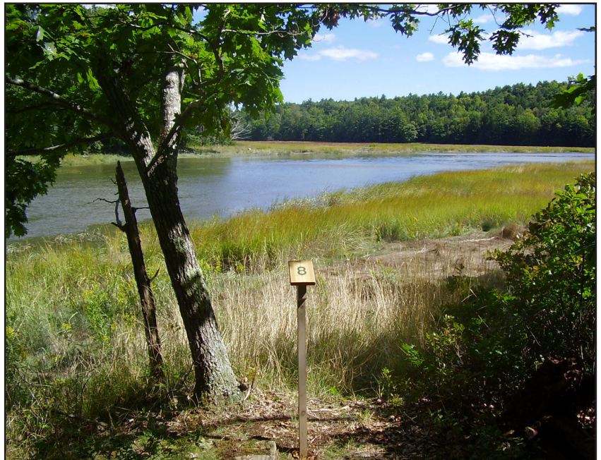
Marsh River, Sheepscot Valley Conservation Association

For more information about Focus Areas of Statewide Ecological Significance, including a list of Focus Areas and an explanation of selection criteria, visit www.beginningwithhabitat.org