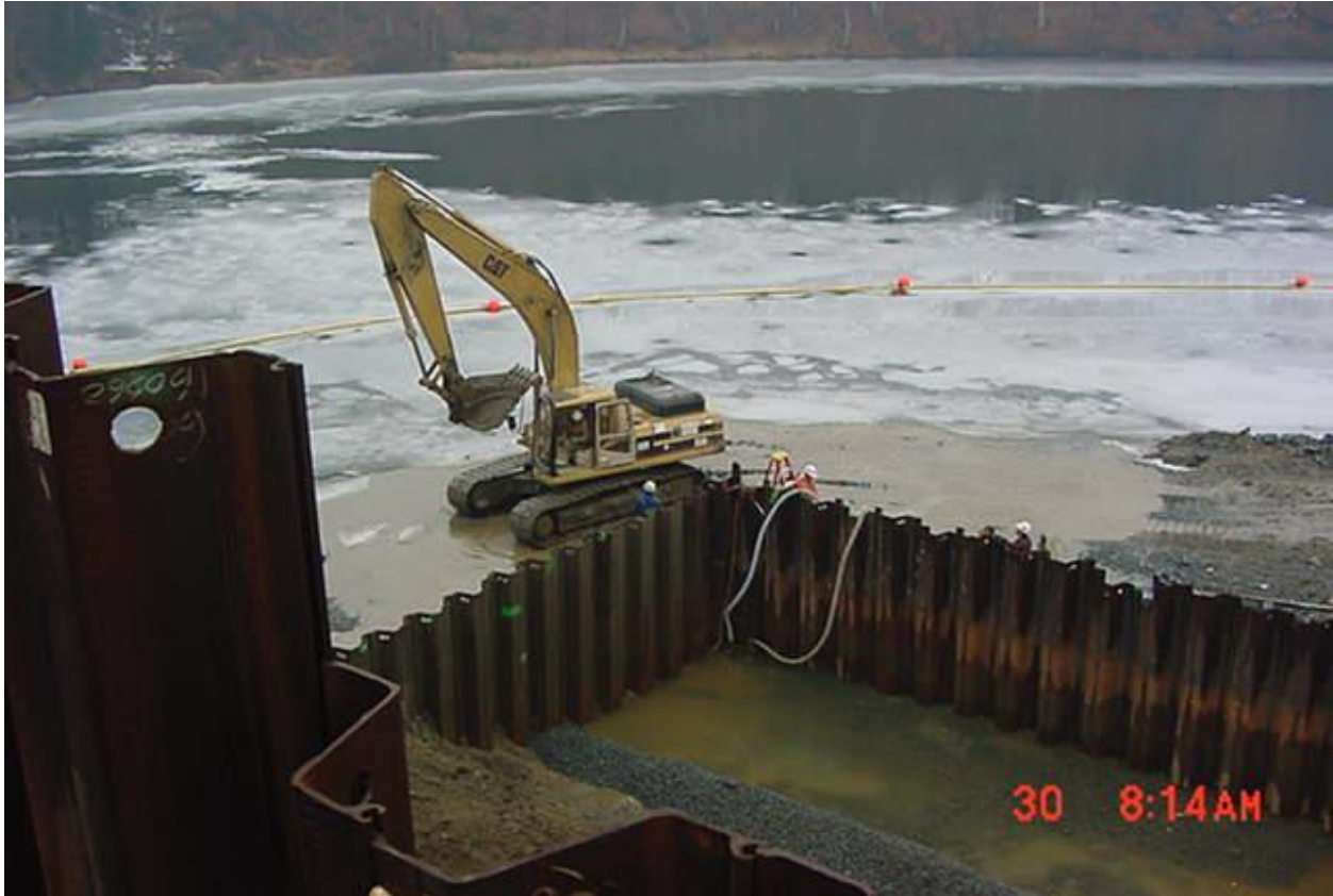
Photo 4: Example of a shoreline coffer cell and excavator on the mudflats.