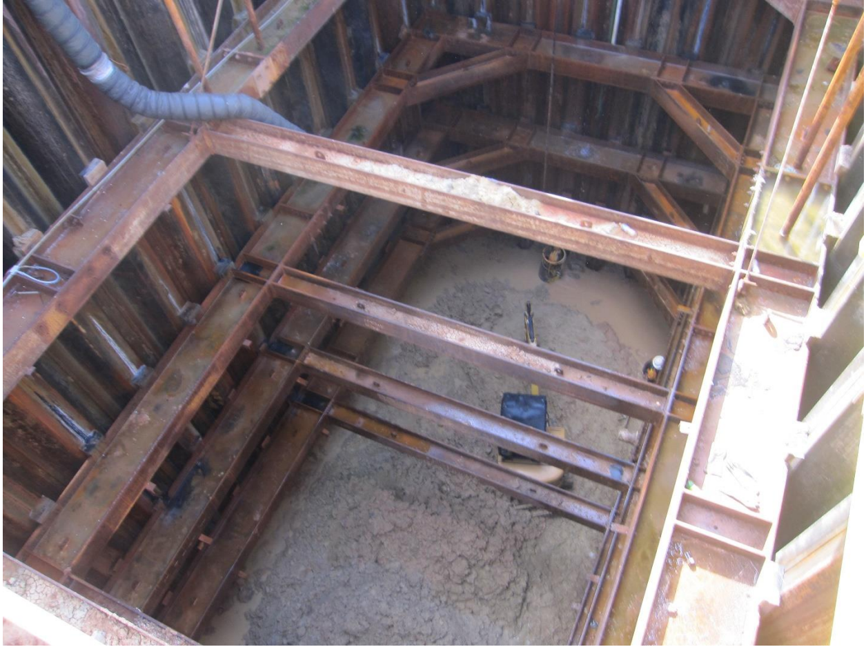
Photo 3: Example of a narrow sheet pile structure with struts to suit this type of work.