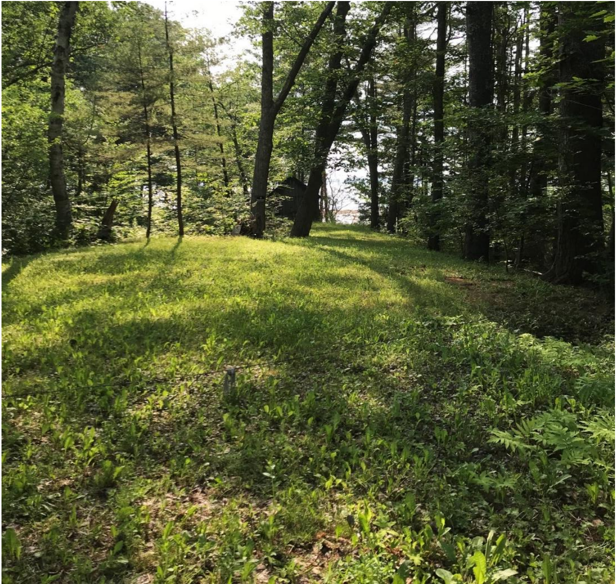
Photo 1: Upland route looking east over the “horseback” roadway zone at the Eckrote property