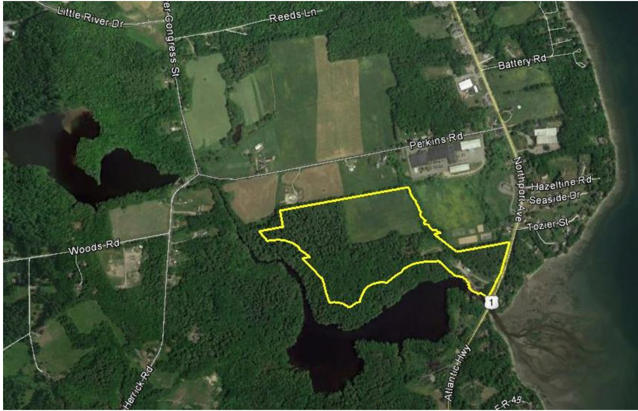
Figure 1. Project Site and Surrounding Area