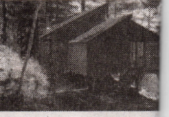
BROOKS Quaint 3 season co