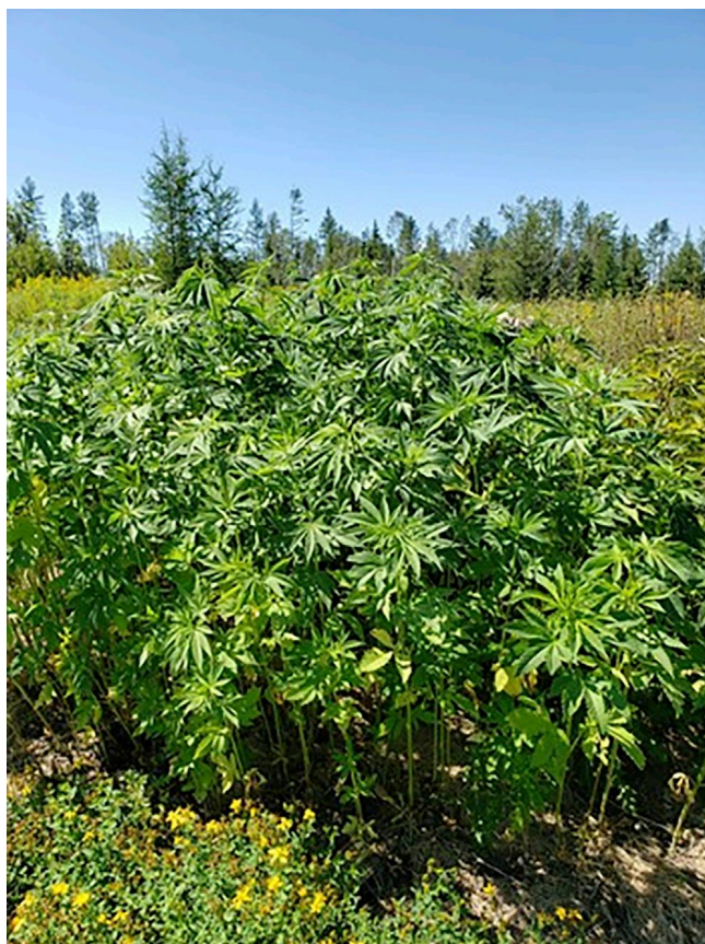
One hemp growth plot in August 2020.