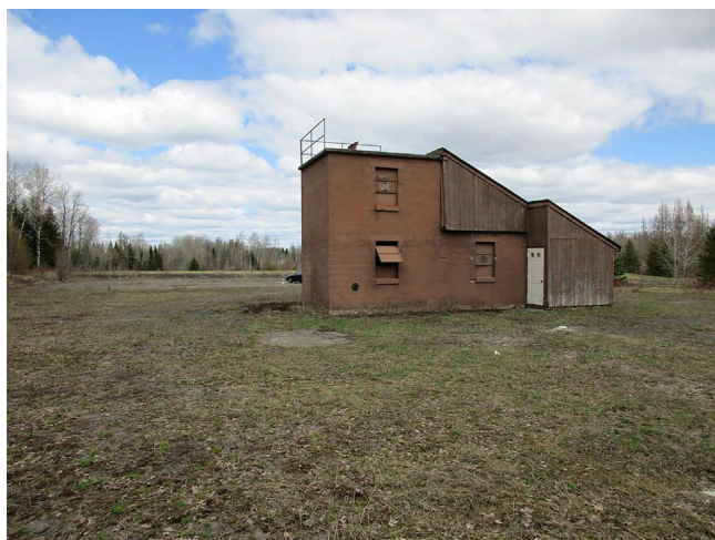
A former firefighting training site at the Loring Airforce Base (2019), now the site of a collaborative phytoremediation project.

from soil (Mahinroosta and Senevirathna, 2020). Phytoremediation, although minimally tested for PFAS, is an appealing option due to low costs and the potential for community involvement. Hemp is a large, fast-growing plant that has been reported as an effective remediator for other types of contaminants (Campbell et al., 2002; Linger et al., 2002; Ahmad et al., 2016). Therefore, we set up a series of field tests to assess the potential for hemp to remove PFAS from the soil at Loring AFB. This topic is interesting to me from a research perspective and also fits the interests of community members involved and the goals of the Micmac people.