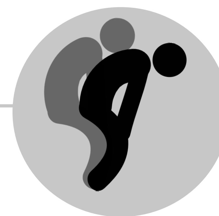
Loss of Muscle Coordination

Few people experience all of these symptoms. Signs and symptoms vary based on the type of toxin. Symptoms can begin within minutes to a few hours, but no later than 24 hours, after eating the contaminated shellfish. Symptoms usually resolve within three days. In extreme cases, seizures, confusion, memory loss, respiratory failure, paralysis, or death can occur. There is no treatment, only supportive care for symptoms.