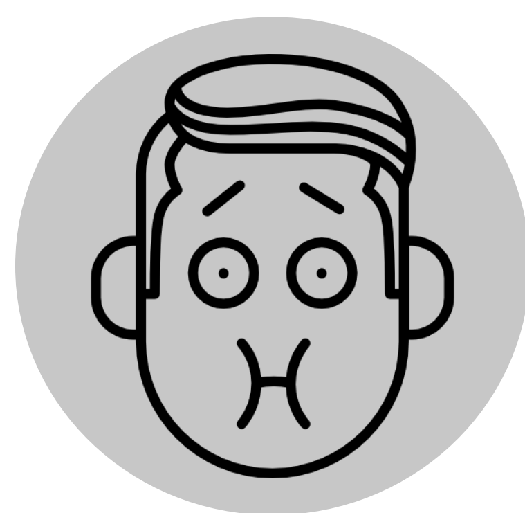
Nausea and Vomiting