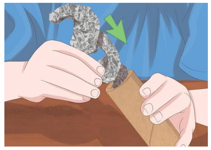
4. Insert foil coil into tube.