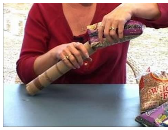
5. Fill tube with gravel or beads