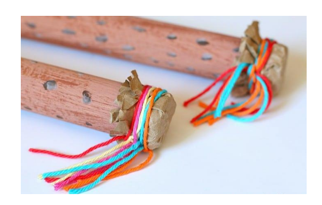
2. Cover one end of the tube with paper.Attach with string or tape