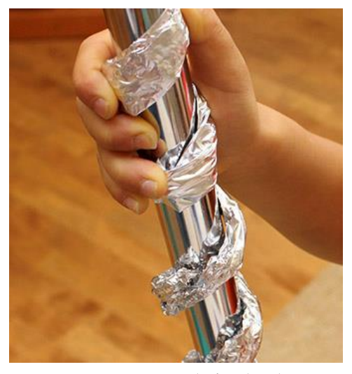
3. Wrap a thick layer of foil around a stick.