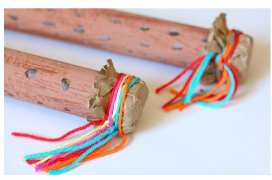
6. Cover the other end