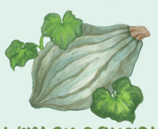
Winter Squash DECEMBER