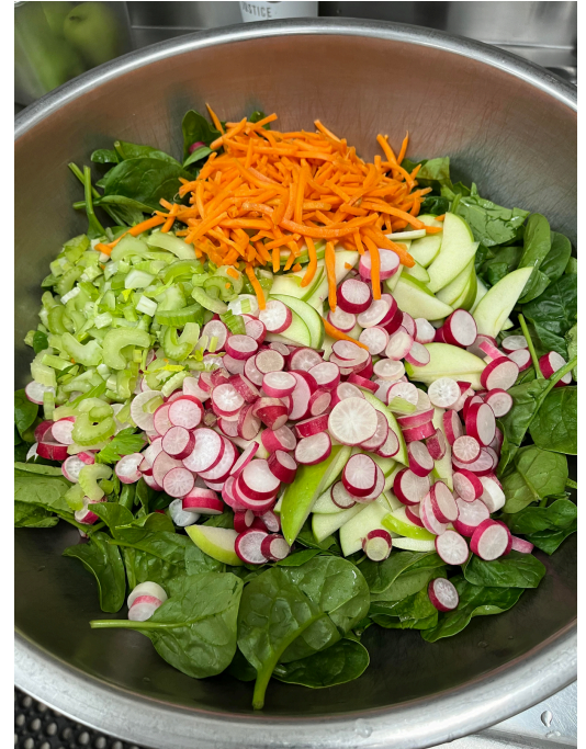
Radish Spinach Salad