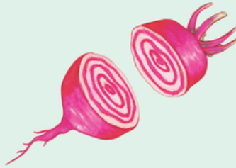
Root vegetables FEBRUARY