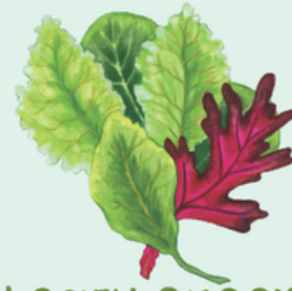
Leafy Greens JUNE