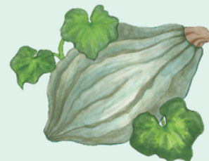
Winter Squash DECEMBER