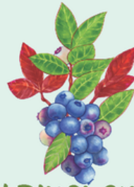
Wild Blueberries MAY