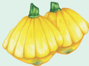
Summer Squash JULY