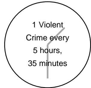
Number of Offenses — Comparative Data 1997–1998