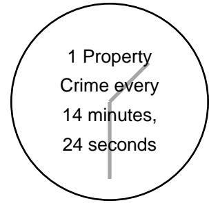
Number of Offenses — Comparative Data 1997–1998