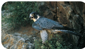
Peregrine Falcon (above) Rusty Patch Bumble Bee (below) Credit: iPac and Maine IFW