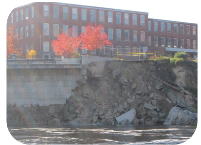
Damage in Biddeford, ME