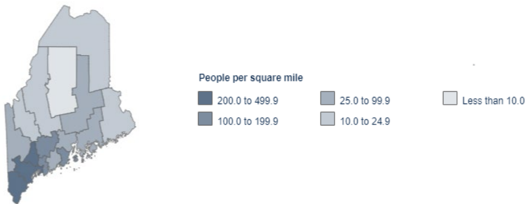
Population Density in Maine Counties: 2020

Over 21% of Maine's population is over 65 and the median age of 44.7 makes Maine the oldest population in the nation. Maine's population is majorly white (90.8%) with only Androscoggin, Cumberland, and Washington Counties with figures below that mark. There are 483 incorporated municipalities consisting of cities, towns, and plantations in Maine . Approximately 125,653 Maine residents live in the 170 towns or plantations with no local public library.